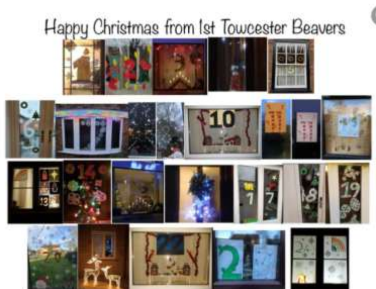
Our advent calendar windows as a Christmas card 202

Meanwhile, we look forward to a summer of face to face activities and a new scouting year full of promise and opportunity!