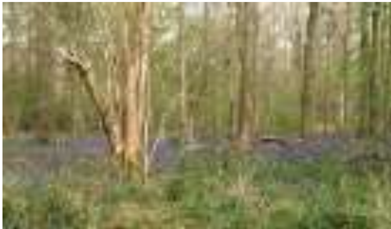
Bluebells in Hazelborough Wood