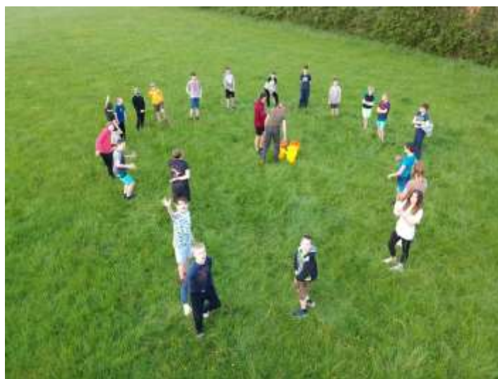
Socially distanced scouting in action!