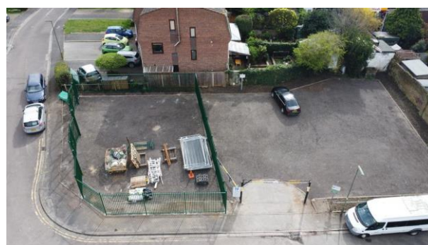
Aerial view showing the high security fencing as installed around the new compound, end of March 2024

The Groups will shortly enter into an updated agreement between themselves to govern the management and administration of the leased property, and to coordinate the performance of the tenant's obligations. Among other things, this intergroup agreement will allocate parts of the leased property to each Group.