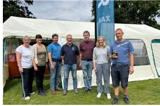
Ajax volunteers ready to open the Bar at the Claygate Flower Show 2024, which attracted more than 5,000 visitors