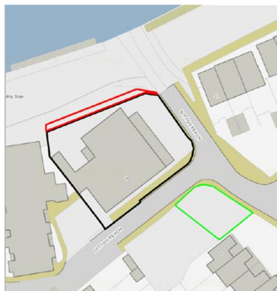
Additional land included within the new lease comprises: (1) a strip of land north of the WAC fenced-in during 2020 (red outline), and (2) the eastern half of the council-owned trailer park (green outline).

Alongside the new lease, Elmbridge and SATC also entered into a licence for alterations, which set out the scope of works that the Groups would undertake to convert the eastern half of the council-owned trailer park into a secure compound for the Groups. The installation of a high-security fence for the new compound was completed and the new compound was brought into use by the end of March 2024.