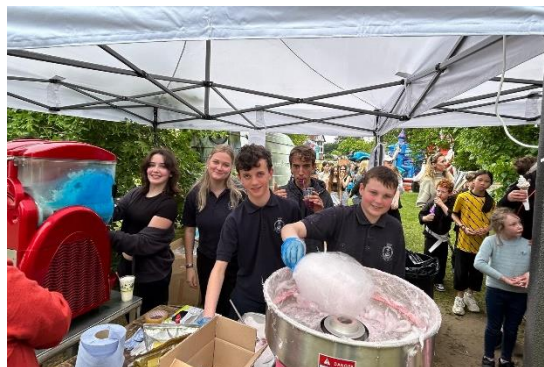
Scouts and Explorers were happy to run the Sweet Stall at this year's Esher May Fair