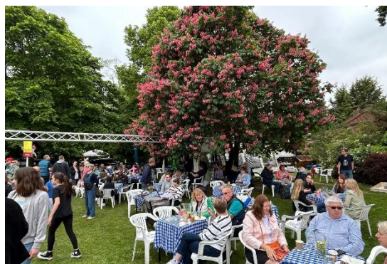
Thank you to all our visitors to the Esher May Fair 2024