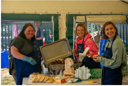
The Ajax Tea Tent at the National Sea Scout Regatta caters for organisers, competitors and supporters