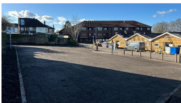
Ajax and Warspite volunteers combined efforts to complete site preparation works in February 2024