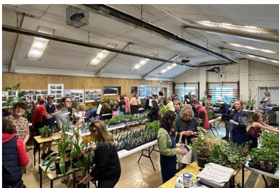
A very busy Saturday morning at the Ajax Plant Sale 2024