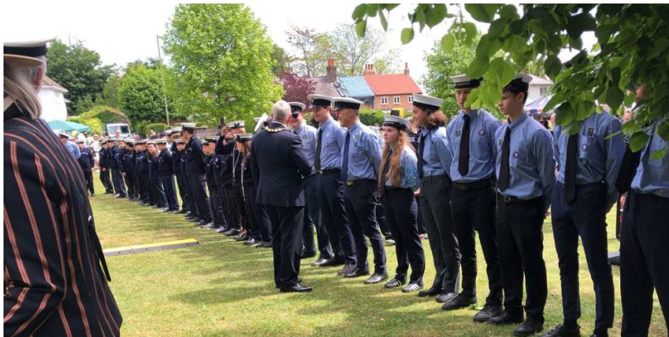
Esher May Fair – Mayor's opening ceremony