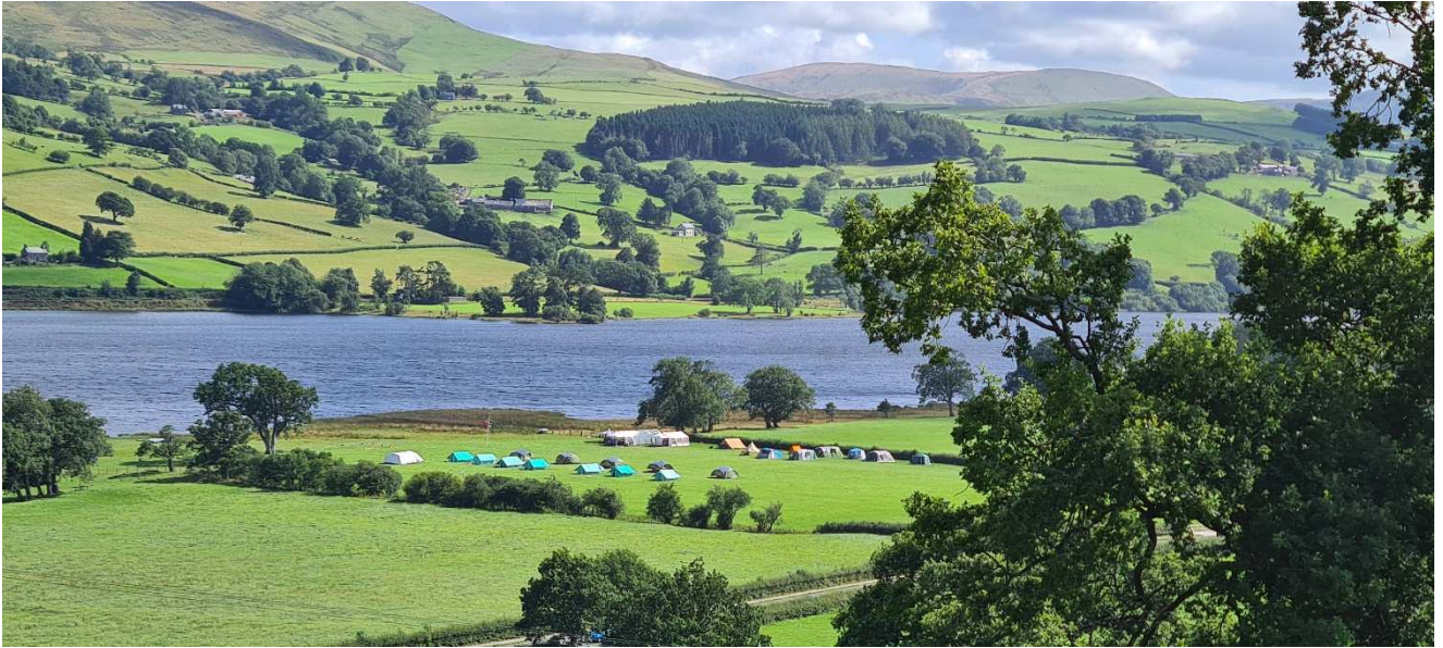
Summer Camp 2022 – Lake Bala, Wales