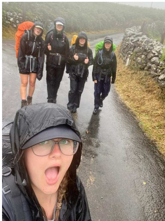
DoE Gold Exped #Be prepared