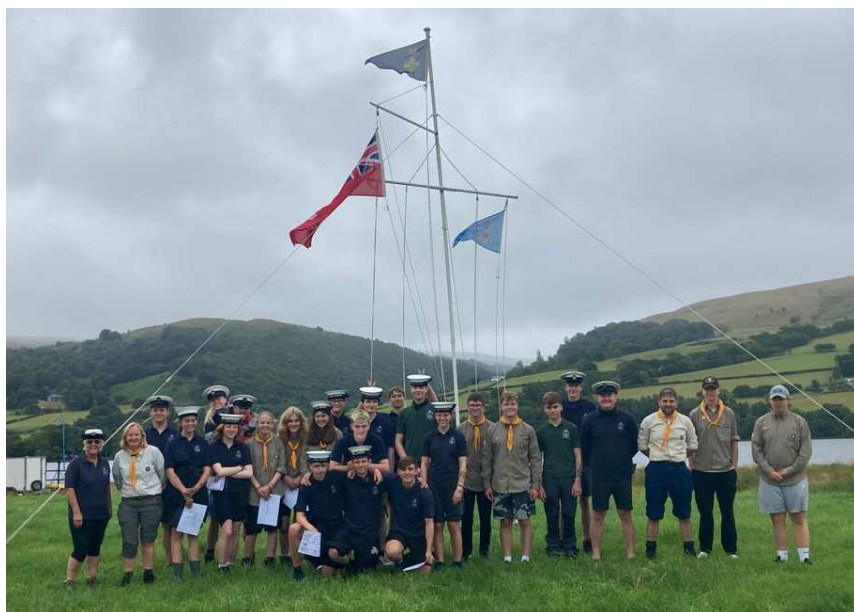
Summer Joint Explorer Camp with 1st Hinchley Wood @ Lake Bala