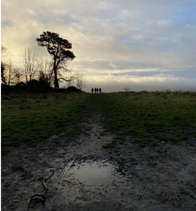
DoE Bronze expedition setting off