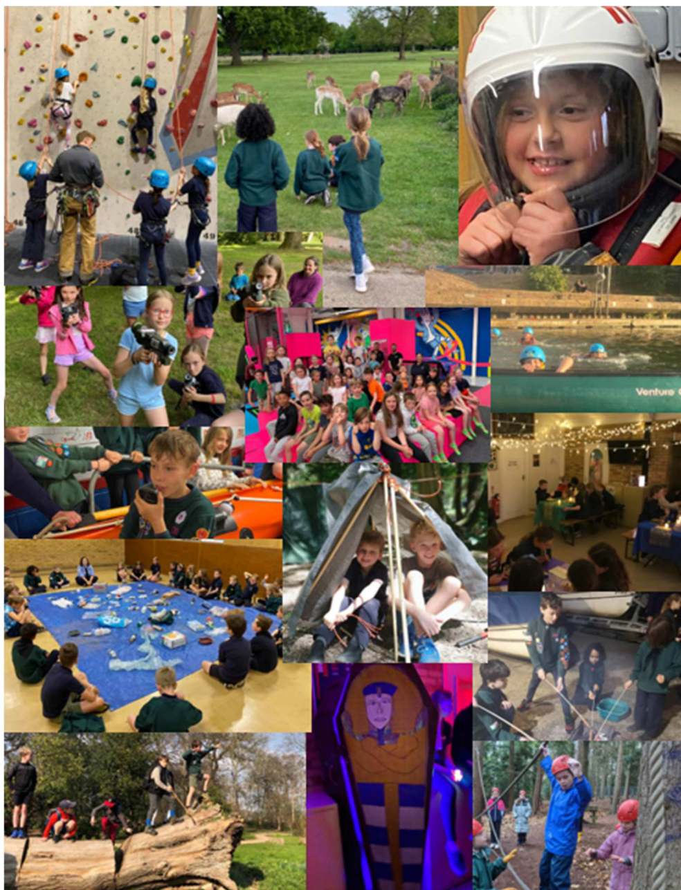
Various Cub activities.

And so, I end by saying, 2021/2 = awesome, 2022/3 = just wait and see what we've got in store! New Cubs, new leaders, new activities... Ajax Cubs