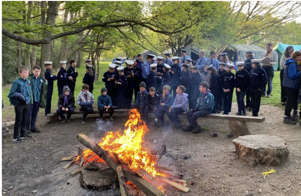
St George's Day – Polyapes Campsite

In May we returned once again to the Cobnor activity centre for a weekend of sailing with the Scouts and Explorers. Following that our ever-popular Esher May Fair event returned for the first time in 3 years. We were blessed with a baking hot day which produced a great turn out and wonderful sales from our beer, BBQ and tea tent.