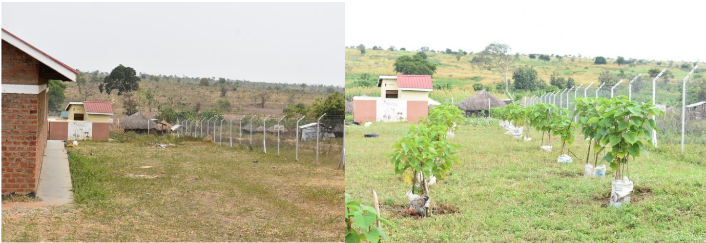
Before and after photo from New Generation Early Childhood Development Centre, Bidi Bidi Refugee Settlement.

5,821 trees planted in 18 Schools (15 in Bidi Bidi Refugee Settlement and 3 in Koboko District). As of September 2022, 55% of trees planted are surviving. HYT has relied on community engagement to carry out all manual work and maintenance associated with forestry. Across the project, 180 men and women have been engaged with casual work, earning extra income and gaining forestry skills.