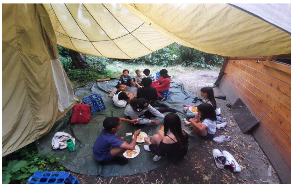
Lunch, UNO and making friends in the shade