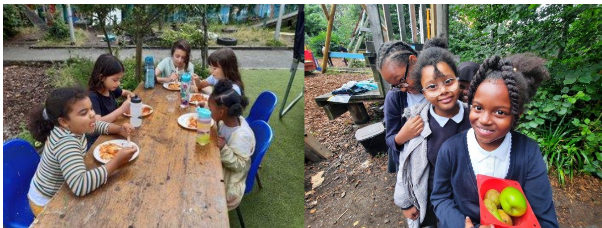
Free lunch and free apple picking!

Adventure play comes in many forms at Triangle and the extensive benefits for young people's mental and physical health can be hard to evaluate. One barometer of the impact of Triangle was seen in a simple experiment this year. A 10 year old child wore a step counter for the duration of their visit to Triangle for a single summer holiday play session. In just over 5 hours the young person covered an impressive 8.39 miles from 17768 steps.