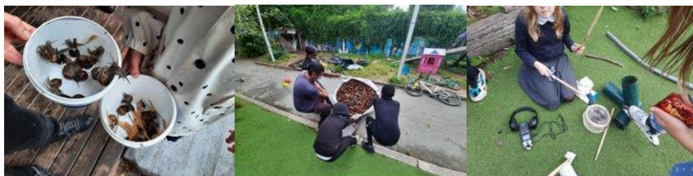
Snail party, teamwork to spread the woodchip, InnerSwell sound recording project

“My daughter has been going for years and always loved it but I think it has become even more important and valuable to her since the pandemic...They get to learn to adventure, to take and manage risks themselves in a safe environment. Helping them build confidence in themselves and their capabilities. (my daughter) comes home full of energy and tales of the gardening, the fires, the battles, the skateboarding, the climbing, the mud cooking etc. I don’t know anywhere else she or other kids can experience this and yet I think all kids need this more than ever now.” - Triangle Parent 2022