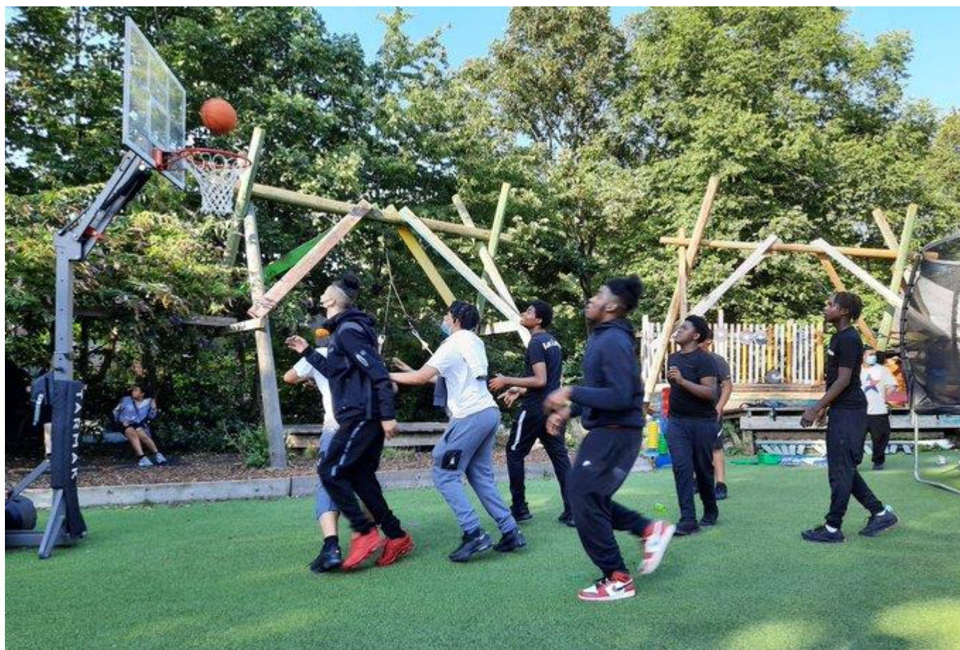
On the buzzer!