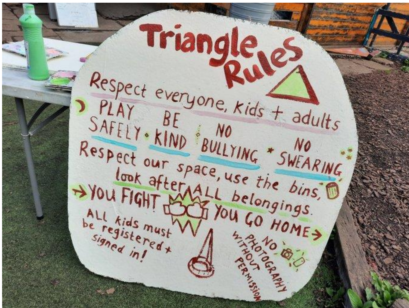
All rules chosen by the young people and they painted the board too

The Berkeley Foundation for their amazing support across the year. We had a wonderful visit to Berkeley St Edward Oval Village for an all you can eat Pancake day party, received donations of easter eggs, halloween pumpkins and advent calendars too. The Triangle also shared the story of our partnership for Small Charities Week and spoke about our work at the Berkeley Fundraising Shooting day as well as attending the Foundation's Black Tie Boxing Event. Particular thanks to the many Berkeley Group staff who have taken part in fundraising events or contributed donations.