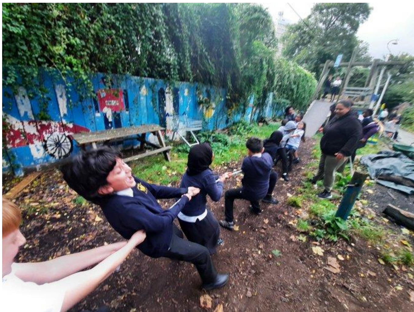
Tug of War on a Tuesday!

The Association provides staff, structures, movable equipment, tools, and materials in a triangle of green space on the Ashmole estates in North Lambeth. The playground is heavily used by local children and young people who otherwise have no access to supervised, outdoor, natural play space within a built-up urban environment. Young people who use the playground are encouraged by its staff to develop a sense of ownership of their playground and to experience 'active citizenship' in that they create and 'police' the playground's code of conduct and lead the development of the site through regular 'Youth Forum' meetings.