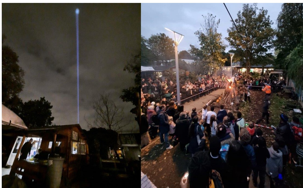
Line of Light and Bonfire Night