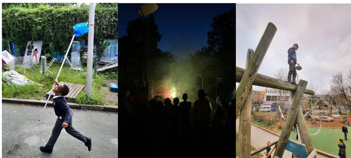
Capture the Flag, camping night fireworks, head for heights