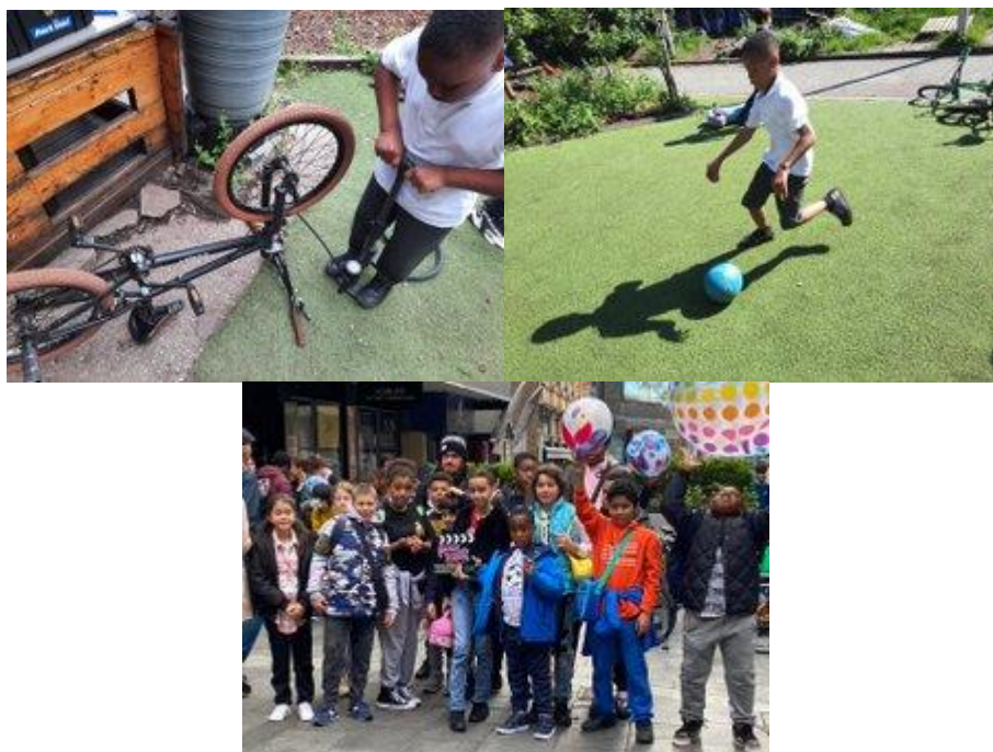
Bike Life, Football practice, Award Winners!