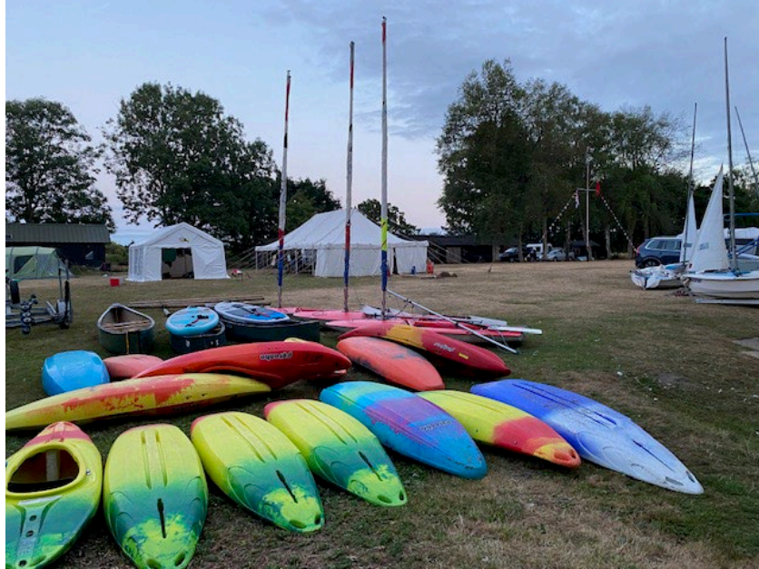
Sea Scout camp at Decoy Broad, Norfolk Broads

Both 3 rd Hertford Scouts and the Sea Scouts had week long summer camps attended by good numbers and a fabulous experience for all involved. The hot sunny weather certainly helped!