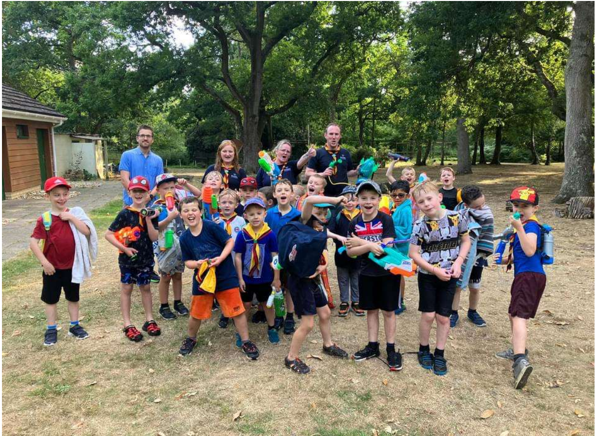
Friday beaver team