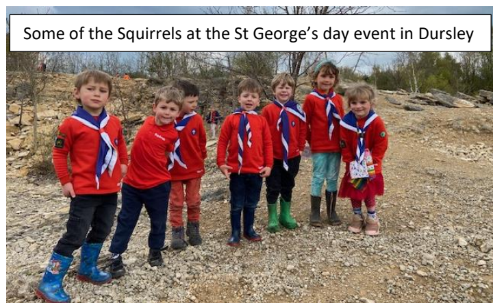
Some of the Squirrels at the St George's day event in Dursley