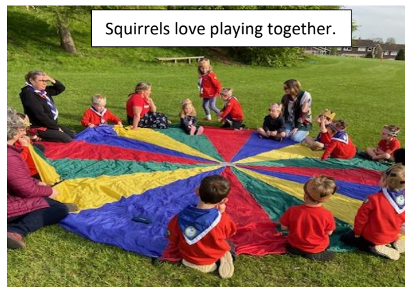
Squirrels love playing together.