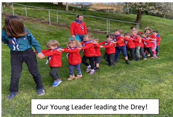
Our Young Leader leading the Drey!