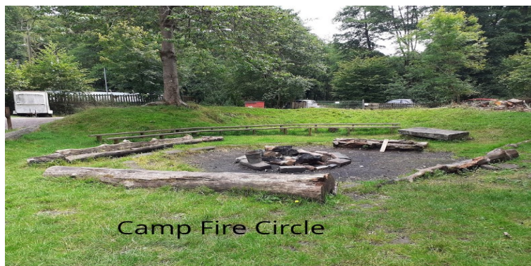
Camp Fire Circle