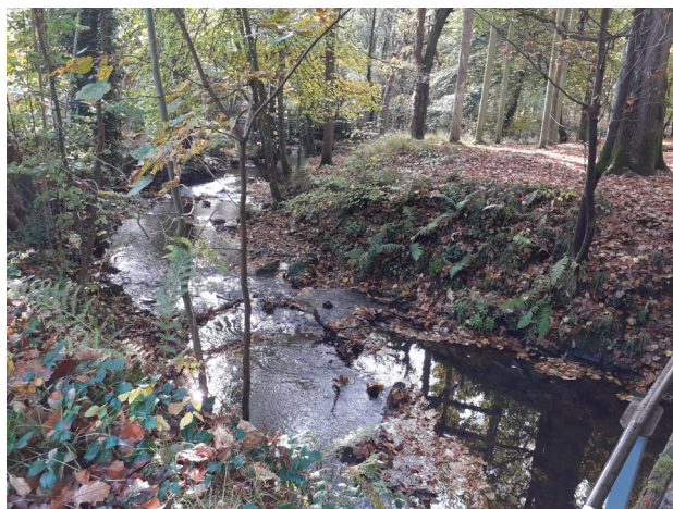
Beaver Lodge, grounds and stream