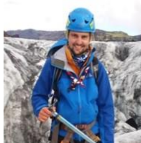
Dorset's Queens Scouts