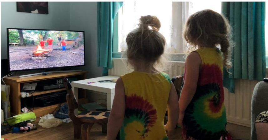
campfire songs from home

Brownsea 113 took place 26/27 June 2020 - our virtual County Camp we 'sailed' to Brownsea Island and all enjoyed setting up camp, cooking, competitions, scavenger hunt, singing and star gazing!