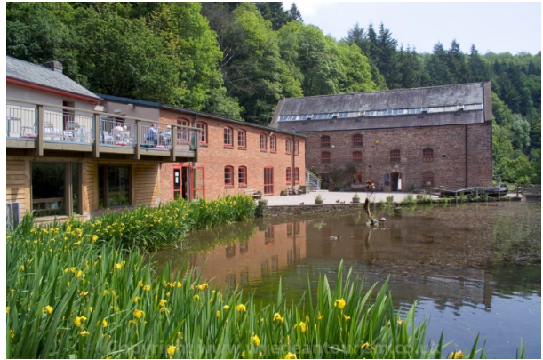
Museum and Cafe