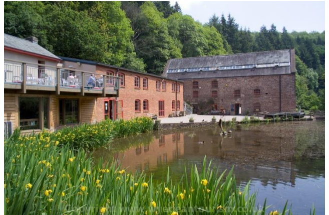
Museum and Cafe