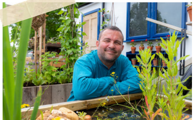
A FEW OF THE TEAM BEHIND OUR GOLD AWARD-WINNING GARDEN AT GARDENERS' WORLD LIVE

Our online self-guided courses continued to provide flexible training and support options across the UK, with a total of 1,300 people taking online courses across our range of local authority composting support, volunteer training, school resources, and public courses.