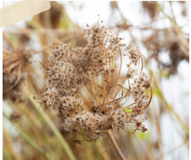
ALLIUM SEED HEADS DRYING IN THE HERITAGE SEED LIBRARY

The Board of Trustees, working with the Senior Management Team, oversee the Charity’s risk management processes.