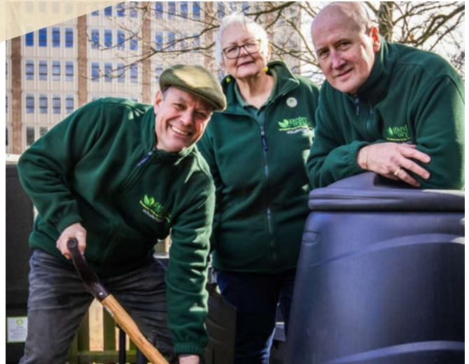
VOLUNTEER MASTER COMPOSTERS IN NORFOLK

We were also pleased to continue our BBC Children in Need-funded work with Young Carers in a new region (Northamptonshire) where we delivered regular organic growing sessions.