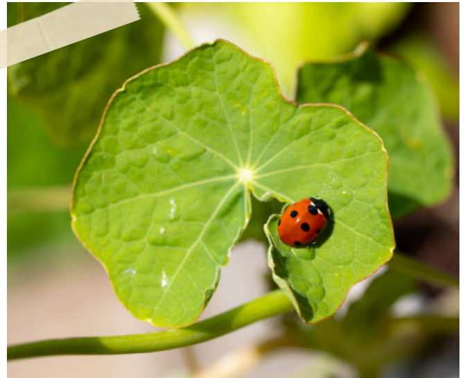
LADYBIRD ON NASTURTIUM LEAF, RYTON GARDENS

In order to meet the reserves requirements noted above, the Charity must consider its available funds. The Charity uses the Charity Commission guidance and calculates these available funds by taking its unrestricted, undesignated funds and excludes its fixed asset investments and adds back its pension liability. This means at 31 December 2022, the Charity has available funds of £18,697 (2021 - £171,896) in order to meet its reserves.