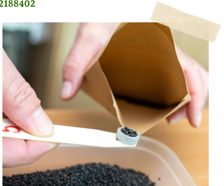
HAND-PACKING IN THE HERITAGE SEED LIBRARY

Registered office: Ryton Organic Gardens, Ryton on Dunsmore, Coventry, CV8 3LG