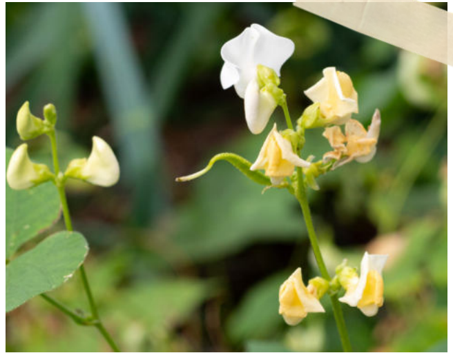
HERITAGE SEED LIBRARY RUNNER BEAN, 'SUNSET'

In 2022, the Charity continued to update its governing documents and policies and also reviewed role descriptions for trustee roles.