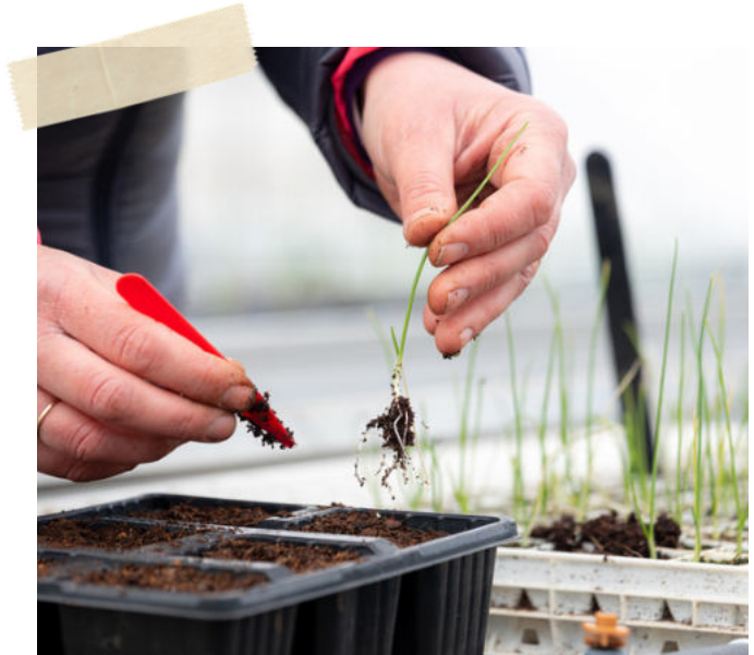
PRICKING OUT SEEDLINGS IN THE HERITAGE SEED LIBRARY

The Trustees are responsible for keeping adequate accounting records that disclose with reasonable accuracy at any time the financial position of the charitable company and enable them to ensure that the financial statements comply with the Companies Act 2006. They are also responsible for safeguarding the assets of the charitable company and hence for taking reasonable steps for the prevention and detection of fraud and other irregularities.