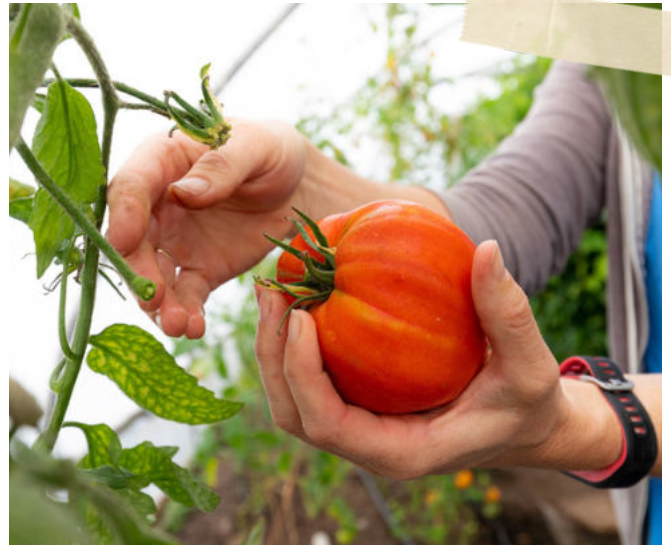
HARVESTING HERITAGE SEED LIBRARY TOMATOES FOR SEED SAVING

The Finance Committee comprises Trustees who are independent of the management and free of any relationship that, in the opinion of the Board of Trustees, would interfere with the exercise of independent judgement as members of the Committee.