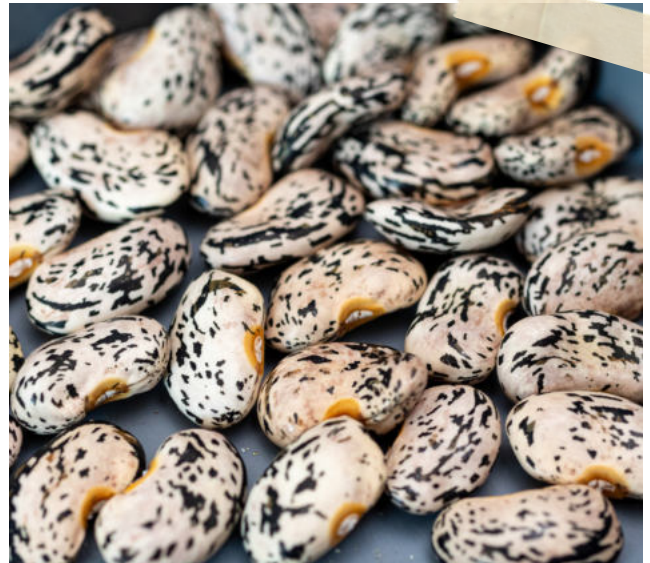
CLIMBING FRENCH BEAN 'BREJO' FROM THE HERITAGE SEED LIBRARY

Alongside this, controls were in place to reduce operational spend in other areas, for example in