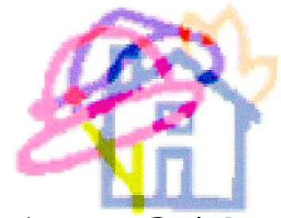
'School in a Box' Project Independent Schools