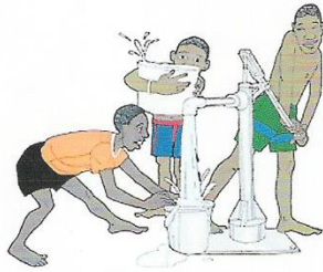
'Water is Life' Project Tube wells & hand pumps