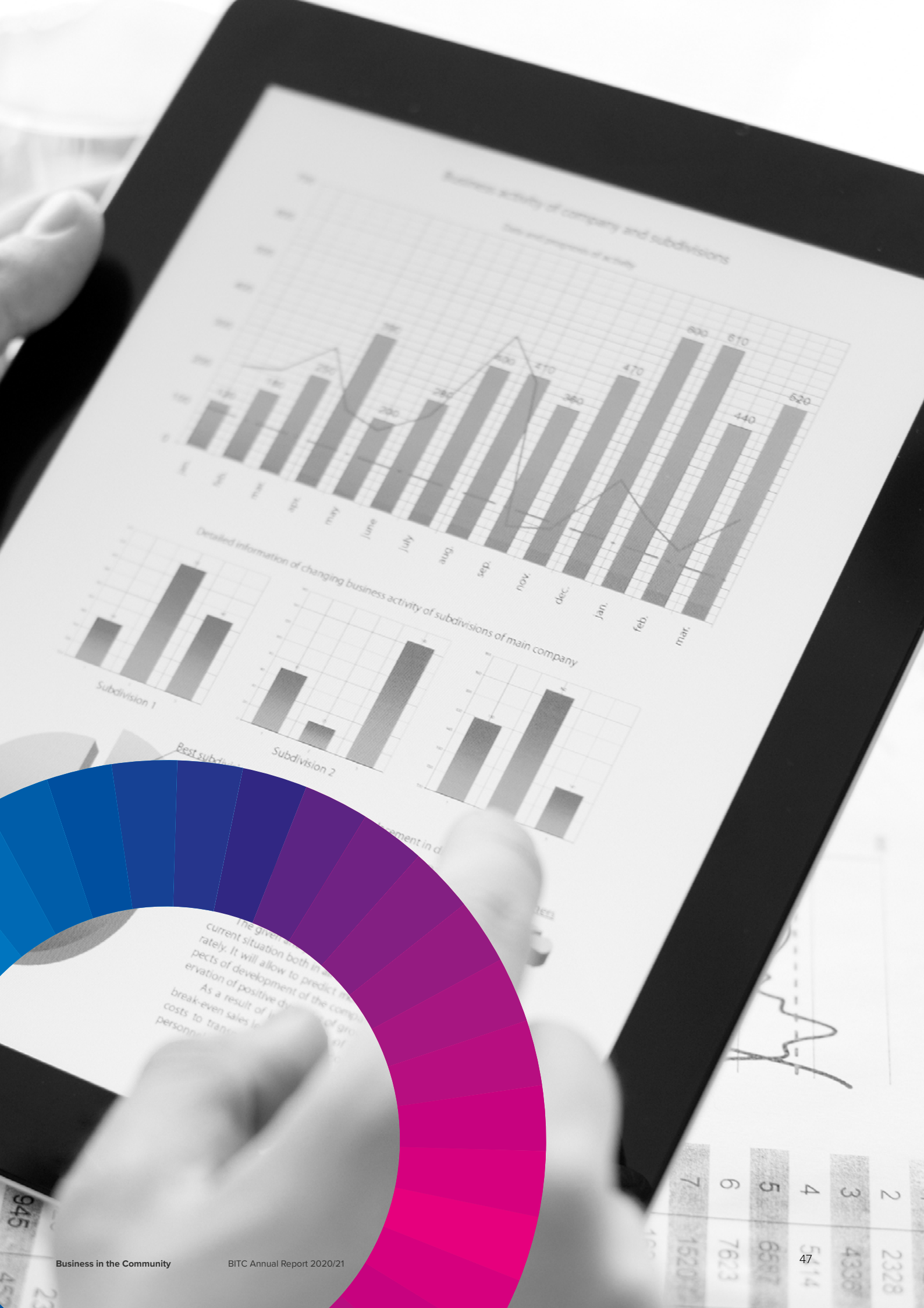
Business activity of company and subdivisions