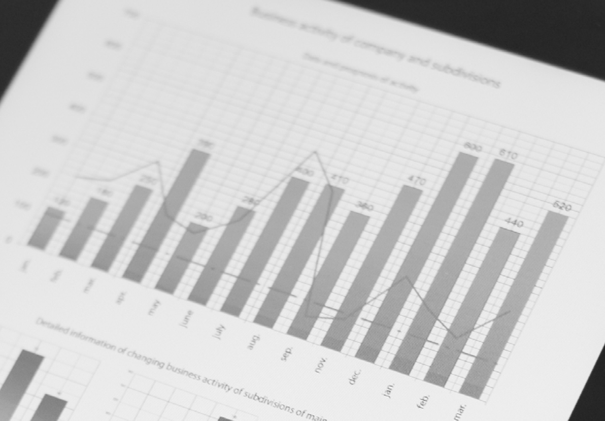
Detailed information of changing business activity of subdivisions of main company