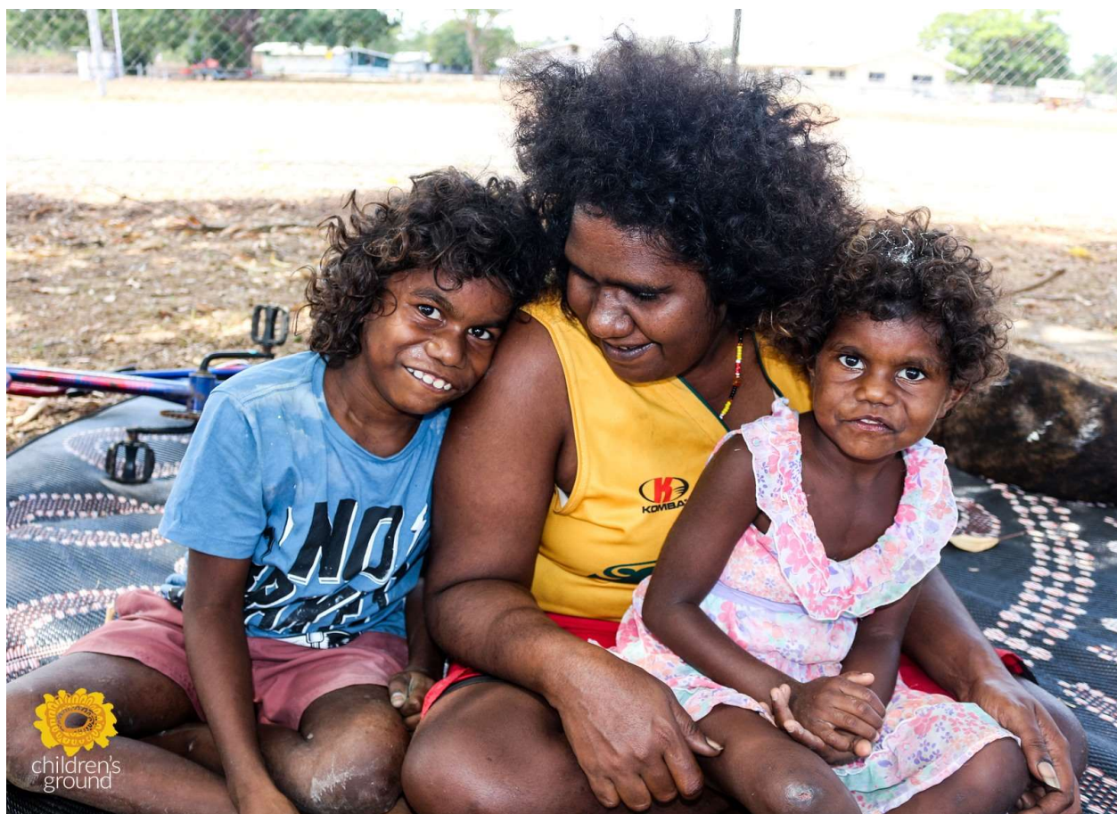
Virgin Unite support Children's Ground as they transform the future for First Nations children in Australia

Right from the beginning, Virgin Unite has focussed on promoting human rights for all people, and the issues of inequality and conflict remain critical. The refugee crisis has worsened as conflict and instability continue in the Middle East, and at least half the world's population are still living without access to essential healthcare. Over ten years ago we incubated The Elders, bringing together a group of global leaders to work towards peace and human rights, more recently we incubated The New Now to stand alongside passionate rising leaders tackling the world's toughest challenges, and we have supported many other organisations working on issues ranging from access to healthcare to criminal justice reform. In 2020 we focused on a number of projects relating to racial justice, exploring how we can further anti-racism within our team and every part of our practices, from our choice of vendors to speaker line-ups and the language we use internally.