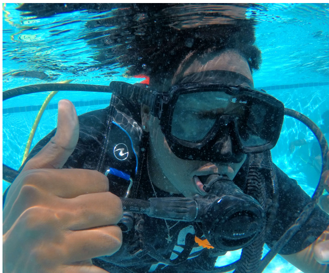
Image from Unite BVI Unite for the Sea programme

Virgin Unite has long been committed to tackling climate change and protecting nature, and has incubated four organisations focused specifically on the planet; Carbon War Room (now merged with RMI), Ocean Unite, The Caribbean Climate Smart Accelerator (CCSA) and Unite BVI. The pandemic delayed many key global decisions on nature and the climate in 2020, so it is all the more important that we push for greater unity and ambition in the years ahead. The next 10 years will make or break any chance the world has of arresting climate change, and it is imperative that we accelerate climate solutions that will give us a fighting chance of success.