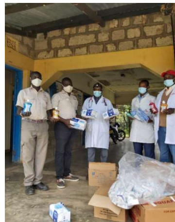
Supplies being distributed from the newly built Enturoto community clinic at the border of Mahali Mzuri's