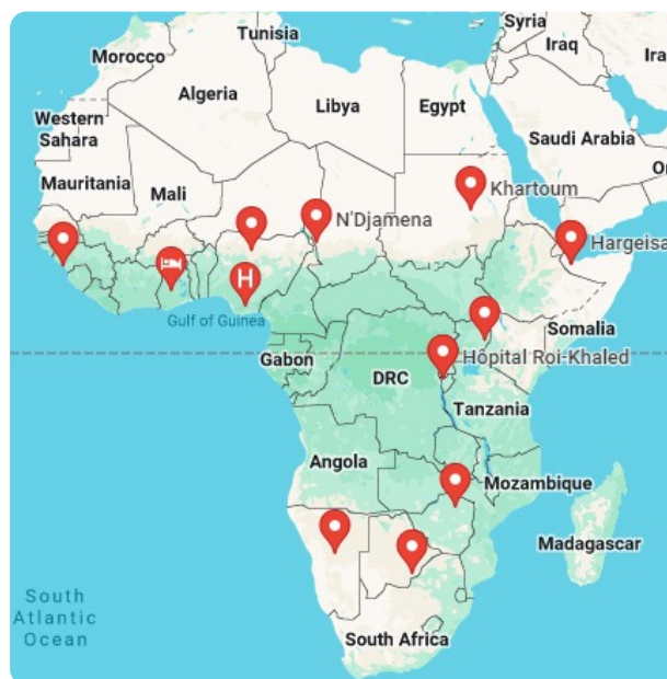
Figure 1 SAFE Africa funded courses

Since the start of the campaign, SAFE Africa funding has been awarded to 15 projects, shown in Figure 1, totalling £140,714.