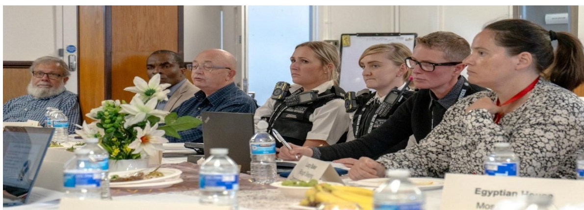
Faith Forum meeting hosted at Al Muntada Al Islami Trust with local community police on 19 th September 2023