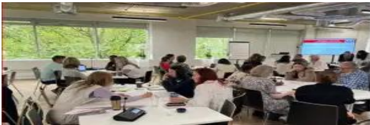
H&F Cost of Living Summer Alliance Workshop and Networking event for helping people and families in the community