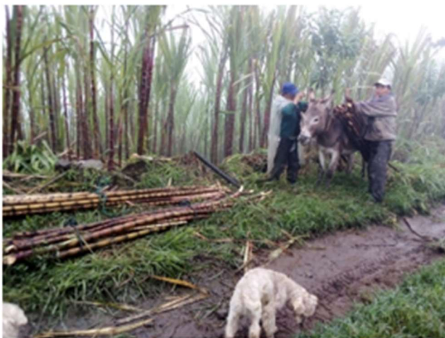
Gathering sugar cane in the mountains of Ecuador - CADO farmers

CADO supports local farmers in a very remote part of the Andes. Our grant in 2020, along with funds from other SD Nationals, was to support them to build a radio communications network so they can carry out their work as a joint enterprise to use local products such as ethanol made from the sugar cane they grow. Previously they've managed to gain the interest of successful companies like The Body Shop and Dr Brunners. Unfortunately during 2021 they suffered a setback when the Ecuadorian government froze their bank account due to a tax charge on a shipment of cargo to be sent to North America. This caused a delay in them delivering their programme of work. They worked hard to resolve this situation.