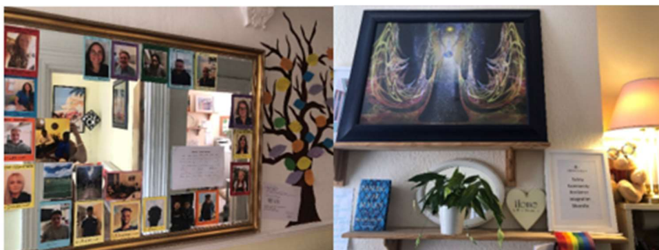
Photos: Enthum House Residential Centre, Eastbourne - new centre opened 2021.

Enthum has exciting news in that it successfully set up a new centre in 2021, a few doors down from the existing one in Eastbourne. The charity has been recognised regionally as a great model for operating this kind of residential refugee centre, and we are very pleased that we have been able to support them over the past four years to get established. Our grants have boosted the local government and other private trust donations they receive to run the centres.