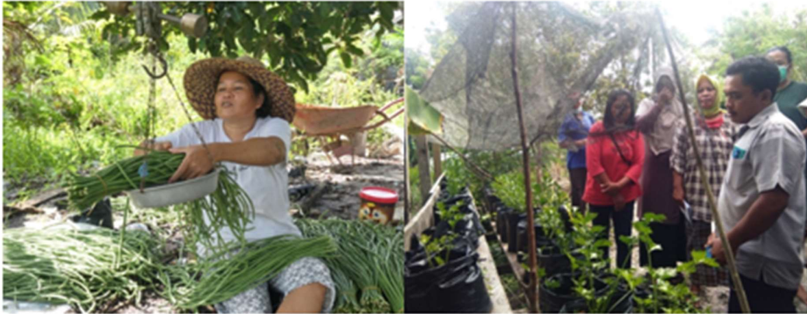
Photos: Agricultural training and harvests in Kalimantan, facilitated by YTS

significant. Working in the environment throws up many challenges for farmers, as anyone might imagine: just when something seems to be going well, a bad season can turn everything around, so it's a continual struggle trying to get the balance of productivity and independence right.