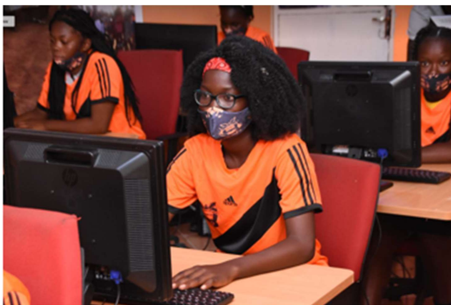
Photo: New IT Vocational training centre at RSD Guelson, Angola

In neighbouring Angola, this is a newer SD project dealing with a similar approach to BFIF in Kalimantan. It provides training in football and handball for young boys and girls. We gave them a grant to establish a job-training programme in IT and computer skills alongside their sports programme, to help their young people get employment. We are pleased that they have been able to make a start with this programme, although they were affected badly by the pandemic and had to close their facility for some time.