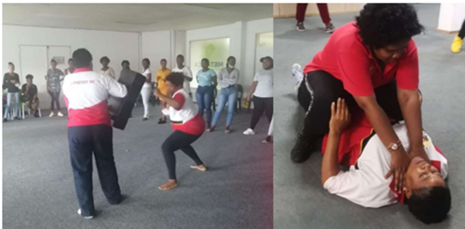
Photos: Self-defence training sessions being carried out by I Protect Me, South Africa

Over the last few years, we have contributed funds and moral support to I Protect Me, and we were pleased to help them again this year. In spite of Covid they have persevered with their worthy programme of outreach to children in communities and schools, using mentoring of students and women to encourage self-protection and defence against sexual abuse. They have begun getting support and funding from the South African social welfare department and other private trusts, so we are very pleased for them as this will aid their sustainable development in South Africa.