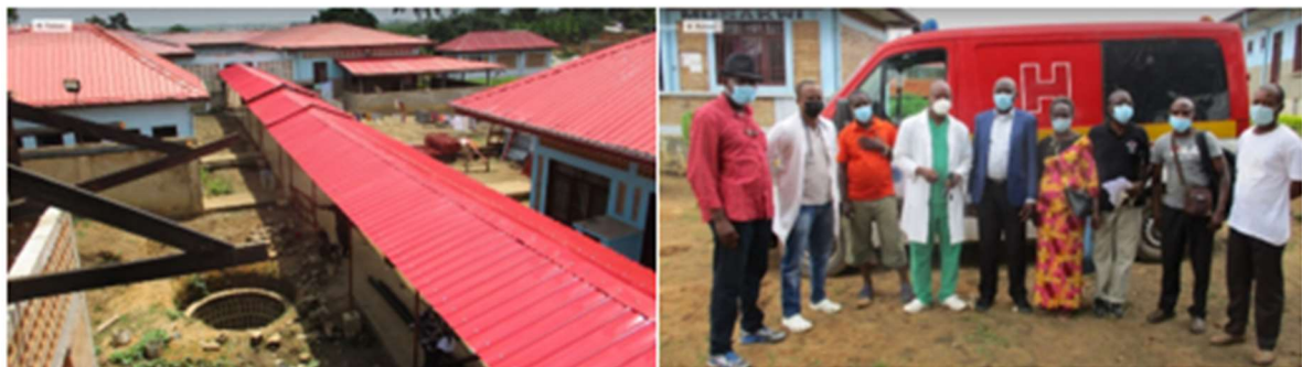
Photos: Health centre being completed at Kwilu-Ngongo, DR Congo

SDB has also supported a training programme at the health centres for the use of local medicinal herbs such as artemisia used in the treatment of malaria. The courses were set up through SD Germany using Anamed, a well-established programme in central Africa.