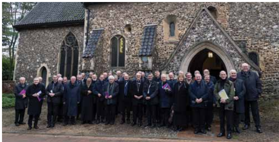
ABOVE: Joint Anglican-Roman Catholic bishops meeting at St Julian's