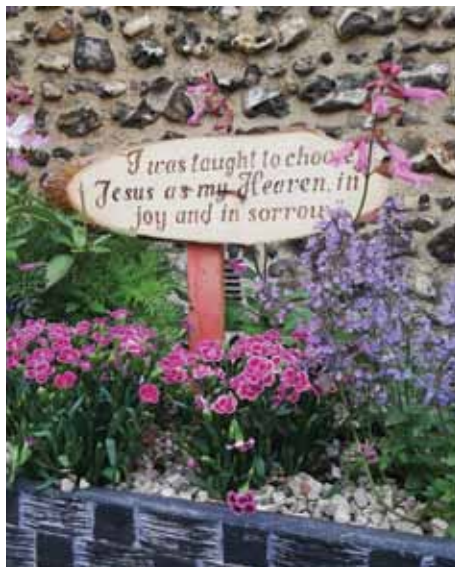
Garden Festival at St Julian's (continued overleaf)