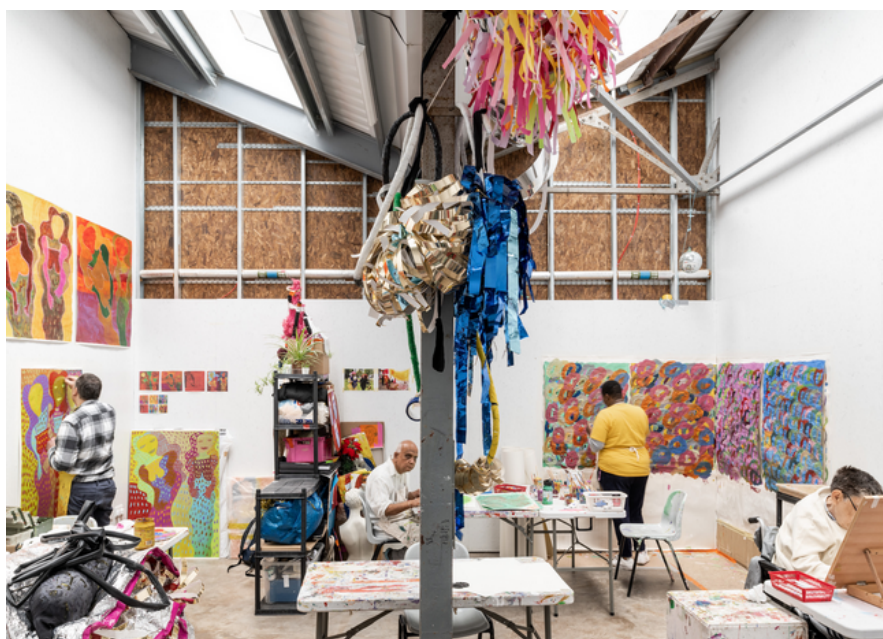
ActionSpace's Studio at Studio Voltaire in Clapham