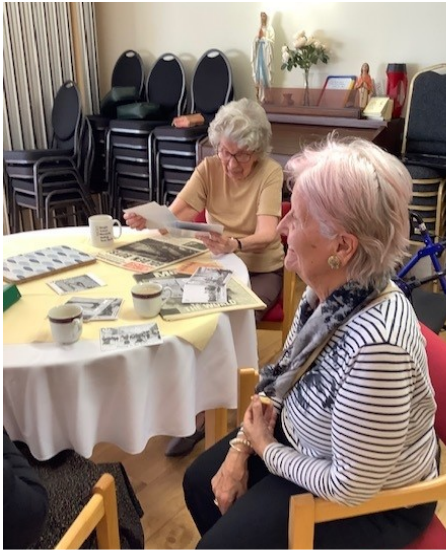
Residents look through old papers, photos, and ration books, remembering the past