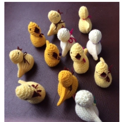
Chicks for the hospice shop

Sisters at the Hospice Day Care Centre and local Drop-in