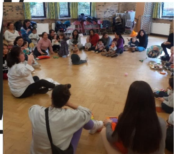
The Toddlers Group