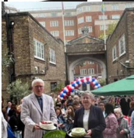
Left: A Sister at a parish event