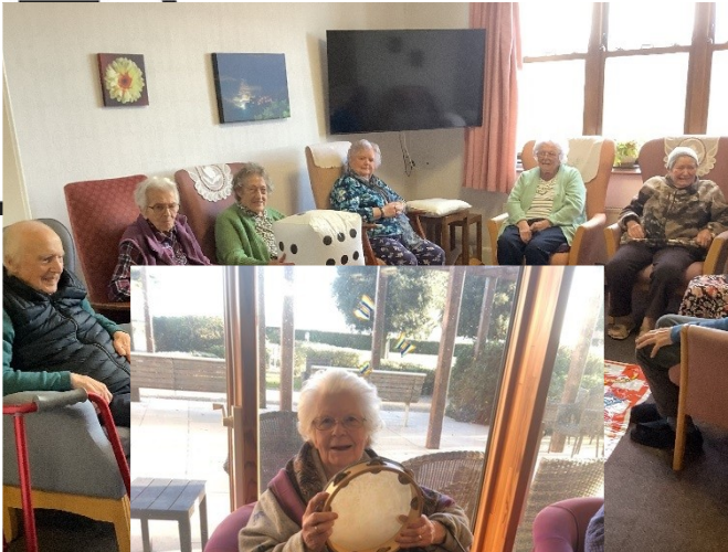
Taking part in a game of Giant Snakes and Ladders