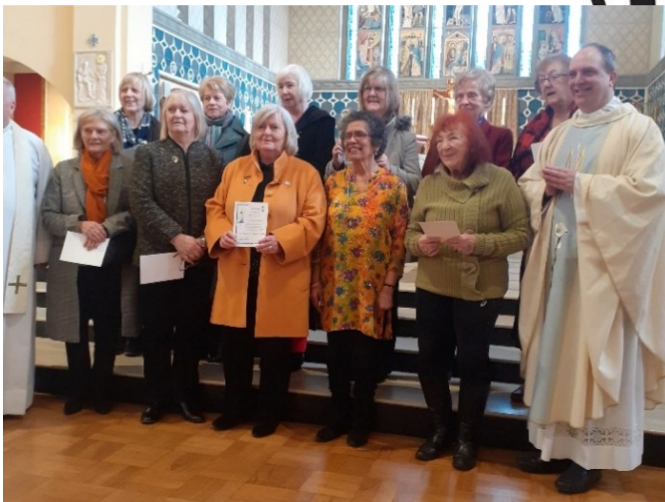
At the Union of Catholic Mothers' Mass, receiving long-term certificates