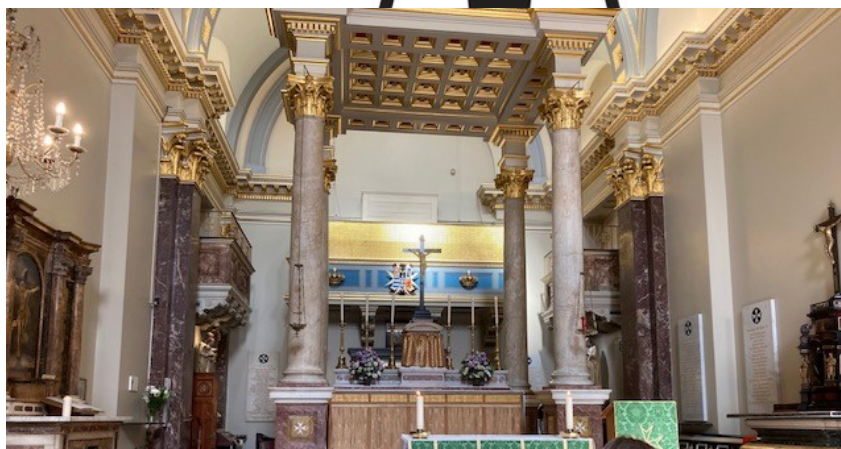
The local Hospital Chapel