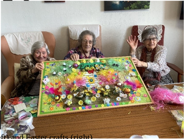
Residents take part in autumnal (left) and Easter crafts (right)