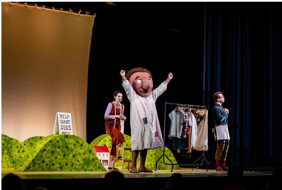
The Smartest Giant in Town, Great Hall, March 2022