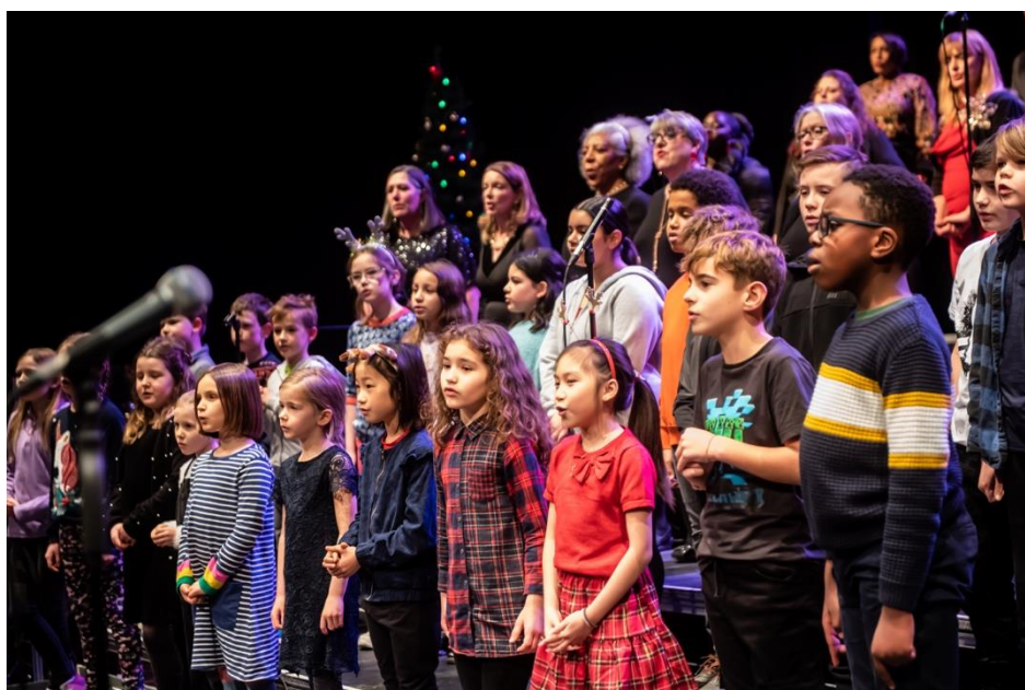
Blackheath Goes Gospel 2021

Blackheath Halls runs a wide-ranging Community Engagement Programme for people of all ages and abilities, including workshops, taster sessions and community performances. Current projects include Blackheath Halls Orchestra, Blackheath Halls Chorus, Blackheath Goes Gospel and the celebrated Blackheath Halls Opera, which brings together a professional creative team with community participants to produce a fully staged annual opera. Blackheath Halls also works with the Greenwich and Lewisham Music Hubs and manages the Blackheath Halls Youth Choir, made up of outstanding young singers of all backgrounds, nominated by their schools.