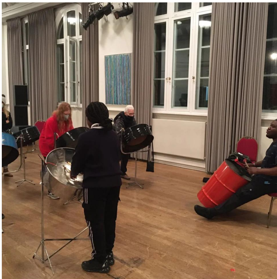
Heart of Steel Steelpan Workshop Lewisham Borough of Culture Launch Day Jan 2022

The transition of the Friends to an inhouse function means that we have the potential to widen and diversify our group of donors, including major donors with the introduction of Patrons, Director's Circle, and Platinum Patrons. We have also seen a huge outflowing of appreciation for our work online during Covid, our swift return to live in person performance, which combined with the desire for social connection the arts provides have resulted in excellent attendance figures this year.