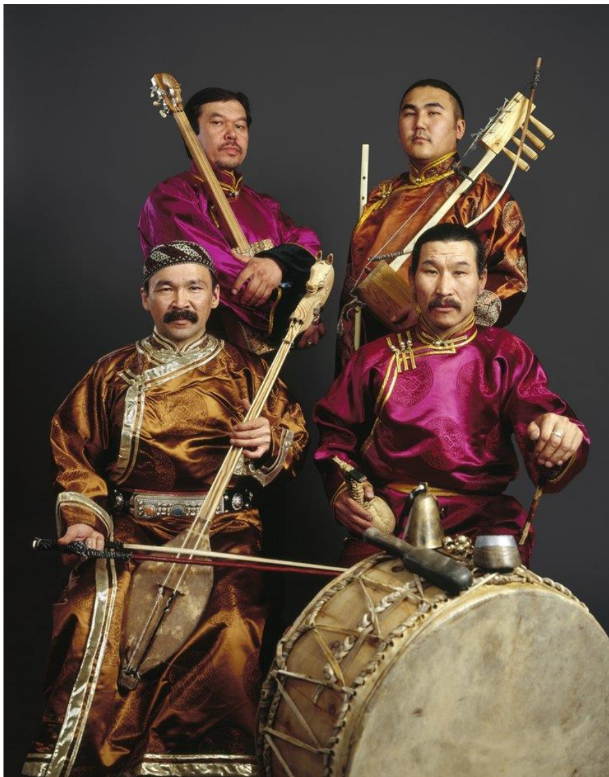
Huun-Huur-Tu, March 2022