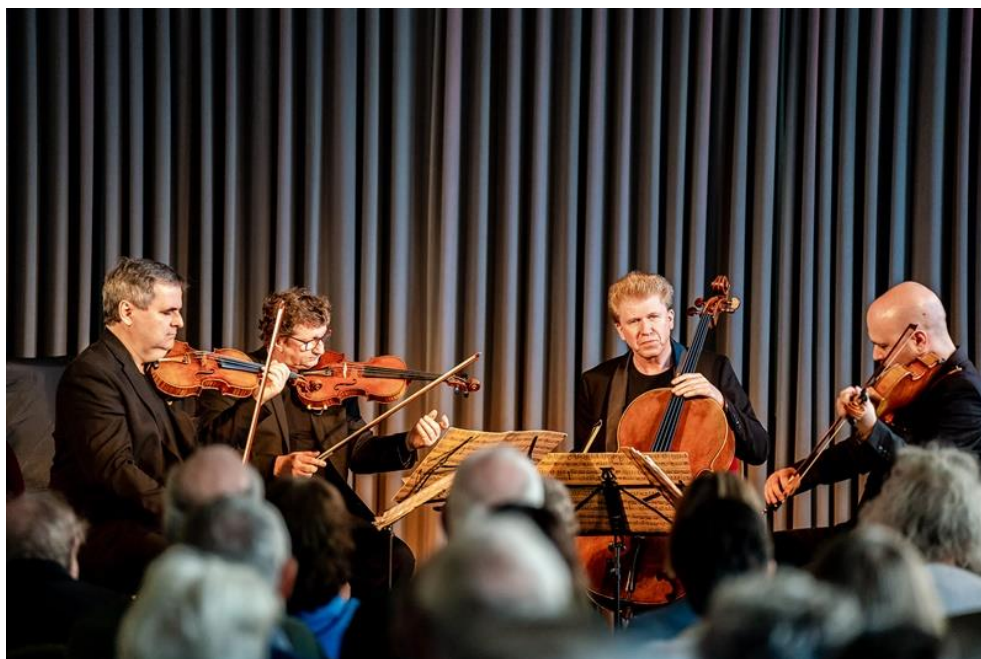
The Wihan String Quartet, Hearn Recital Room, March 2022

We therefore managed to offer a full programme throughout the whole of 2021/22. This in itself has felt like a considerable achievement, as there was continued uncertainty about regulations going into the start of the year, coupled with continued use of furlough for much of the staff team, alongside frequent absences later in the year due to quarantine and illness. This has also been our first full financial year of 'normal' operation since the building re-opened after refurbishment in November 2018.