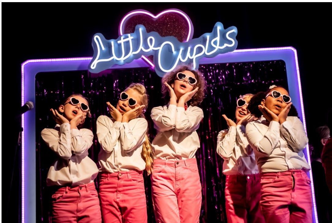
Venus and Adonis, 2021