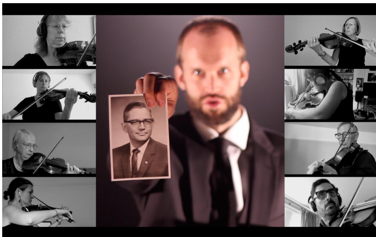
Still from 'A Journey Through the Rake's Progress' Blackheath Halls Opera on film, August 2020