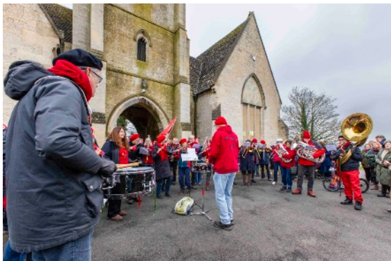
Stroud Red Band playing at the 'Love the Chapels' event

In the meantime, health issues were affecting several of the trustees, and we felt pretty precarious. The mid-summer of 2024 was definitely a low point for all of us.