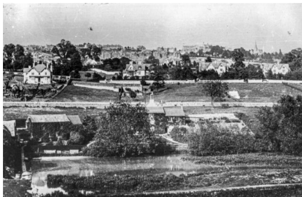
Our archive image of Arundel Mill buildings, its pond and the Chapels of Rest just visible on the right hand skyline

A couple of our freehold properties have been taken on by new owners. This has resulted in a great deal of work in order to complete recently introduced legal documents showing our ownership, whilst answering endless questions from solicitors and potential buyers. However, with regard to The Garden House at Arundel Mill, this was achieved successfully, and two new artists have arrived in Stroud. There are still negotiations going on for one other property.