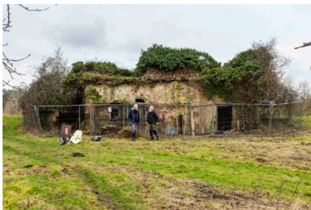
Meeting with Gloucestershire Orchard Trust to advise on their old ruined 'Fish House' on the east bank of the River Severn at Longney

Other activities have included a site meeting with Gloucestershire Orchard Trust, who are clearing an extensively overgrown and dilapidated former River Severn fish house near Longney. The building was part of ancient orchards left to their Trust in a will. They are considering whether to renovate this structure for use as a public shelter and information point on the Severn Way footpath, which crosses the orchard's riverside position. The SPT trustees offered some guidance on fundraising and an initial assessment of the structural issues being revealed, but will not be further involved.