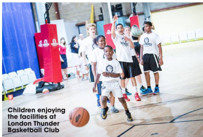
Children enjoying the facilities at London Thunder Basketball Club