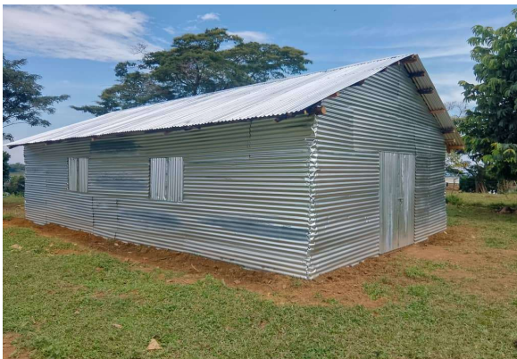
New church structure at Kiwiri, Kilugu Island, Uganda

A further cross-denominational mission to the Ssesse Islands took place in June 2024, co-ordinated and led by Gichuru Jeremy but involving missionaries from many different churches and denominations. This outreach focussed on Kilugu, Kyewerwa and Butulume Islands.