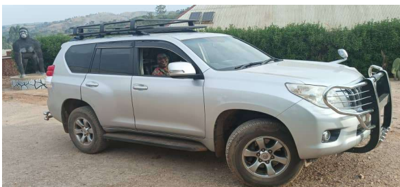
New vehicle provided by Discovery Trust supporters

During the year Gichuru's car reached the end of its life, developing multiple problems and being no longer cost-effective to repair and maintain. Supporters in the UK were able to contribute enough funds for a 4x4 replacement of good age and condition.