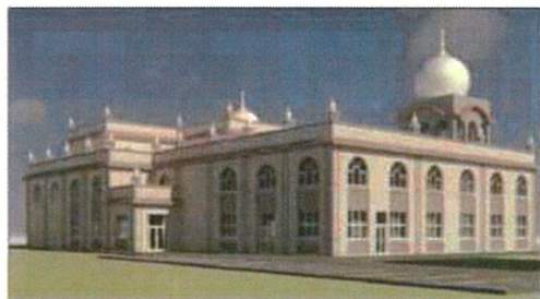
Above: 3D image of proposed GNKS London Complex from Cambridge Close