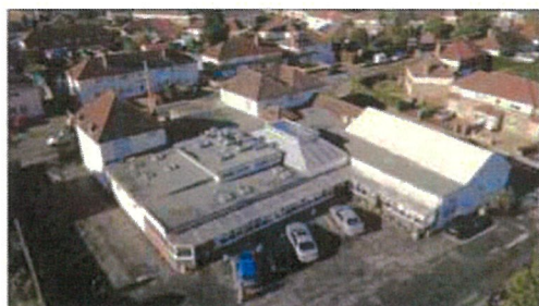
Above: Current Aerial view of the GNKS London Complex from Cambridge Close