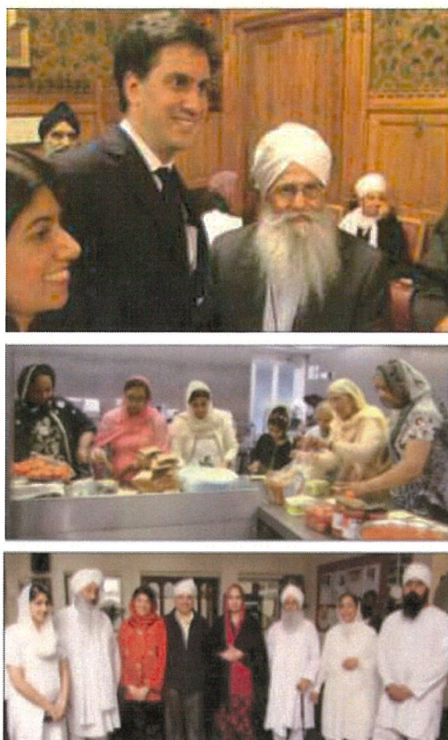
Snapshot of activities in key events, preparation of langar and community engagement