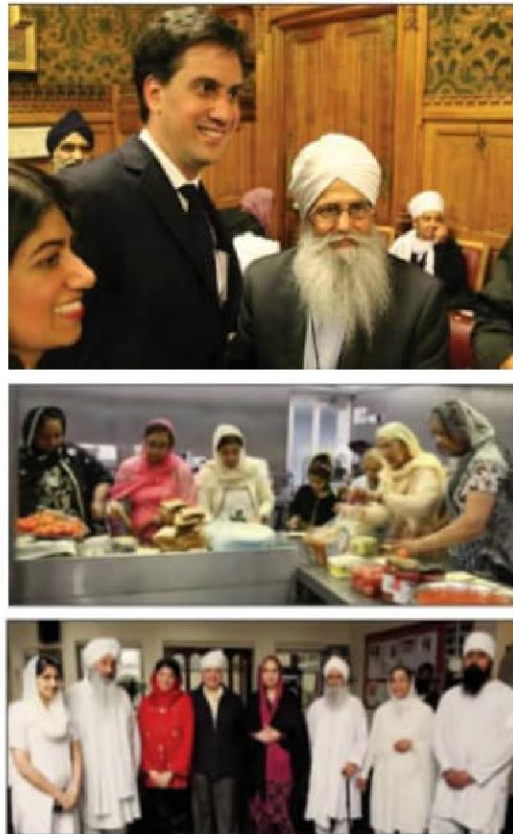
Snapshot of activities in key events, preparation of langar and community engagement