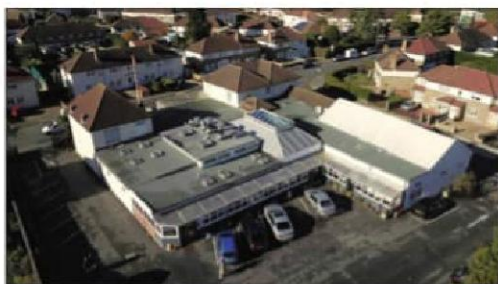
Above: Current Aerial view of the GNNES London Complex from Cambridge Close