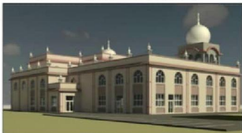
Above: 3D Image of proposed GNNES London Complex from Cambridge Close