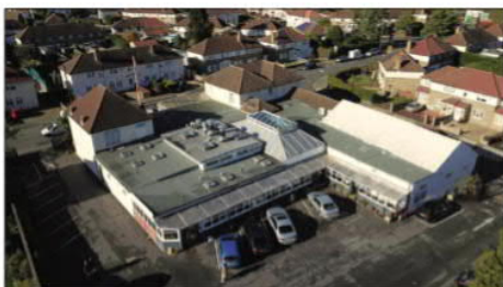
Above: Current Aerial view of the GNNSJ London Complex from Cambridge Close