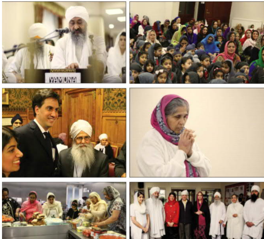
Snapshot of activities in prayer, service and community engagement