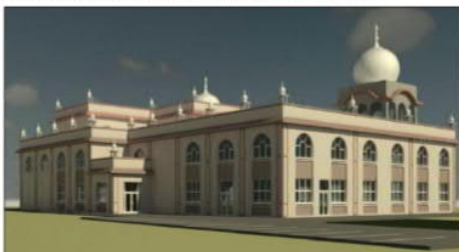
Above: 3D Image of proposed GNNSJ London Complex from Cambridge Close