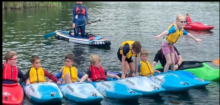
Fun on the water at Southwater