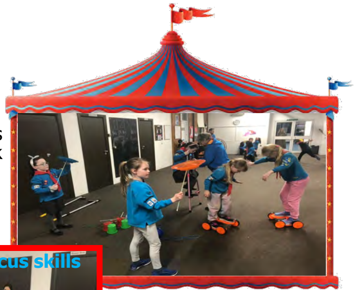
New Circus skills learnt

So many activities completed. So much fun has been had.