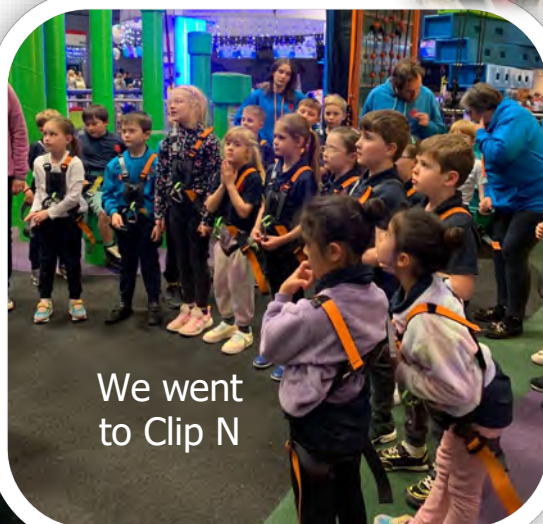
We went to Clip N

We had an amazing time at Go beavers and many new experiences were had there.