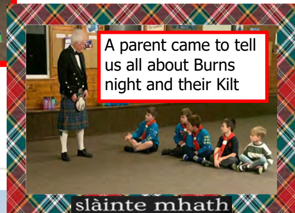
A parent came to tell us all about Burns night and their Kilt

We had fun flipping pancakes on pancake night