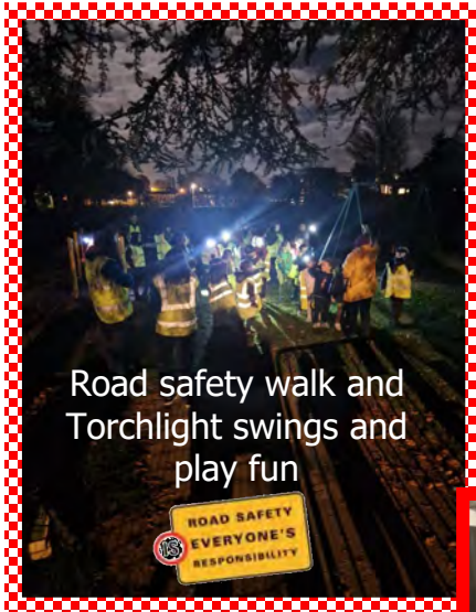
Road safety walk and Torchlight swings and play fun