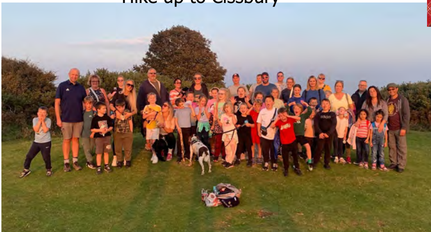
Hike up to Cissbury

At the end each term we hold a badge presentation evening where parents are asked to stay for the night to watch their child's badge presentation and then join in with the rest of the evening. It's always nice to see all parents and beavers together.