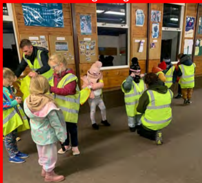
Walk and Quiz

The aim of my report this year is to show through photos what fun we have at beavers and mention a handful of the many many activities we have done this year.