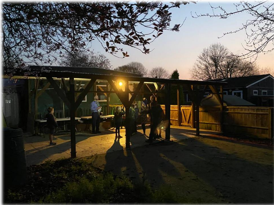
Scout Garden at Grove CofE school