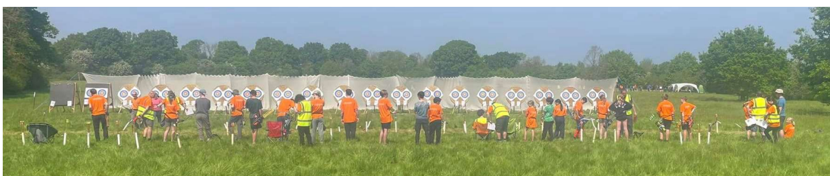
Loddon Cubs, Scouts & Explorers at NSAC

We held another District master at arms course at Twyford with 4 Troops (and 2 Cubs) taking part. And yet again went to the National Scout Archery Competition (NSAC) this time our secret weapon (the Cubs), as well as the Scouts and Explorers, winning yet more trophies and medals (I even won one, finally, and so did one of the Cubs!).