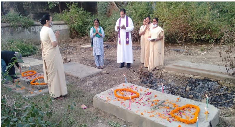
Mirzapur Cemetery, Mirzapur, Uttar Pradesh, India.