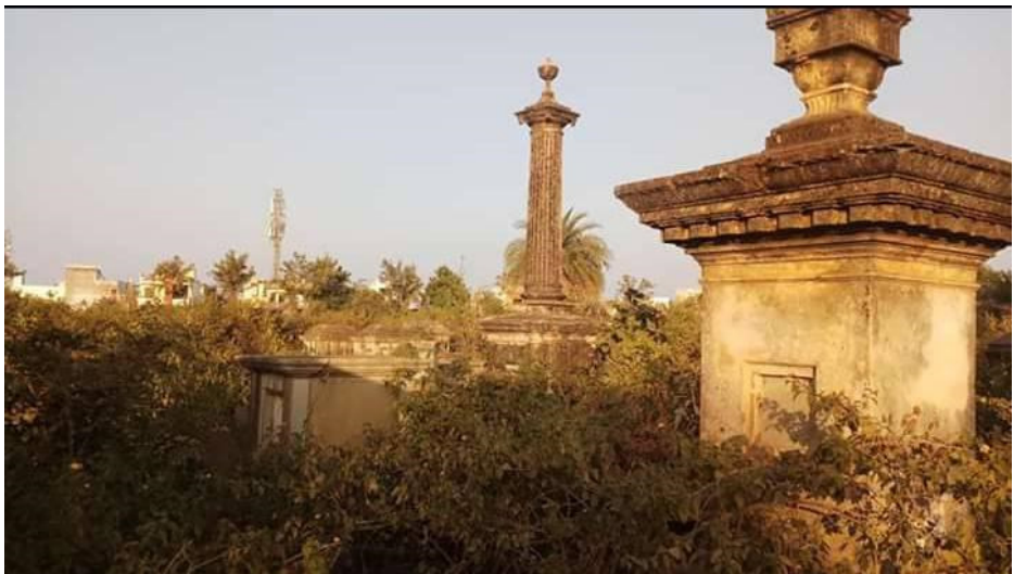
Neemuch Cantonment Cemetery, Madhya Pradesh, India

The accounts for the year ending 2020 are published elsewhere in this report.