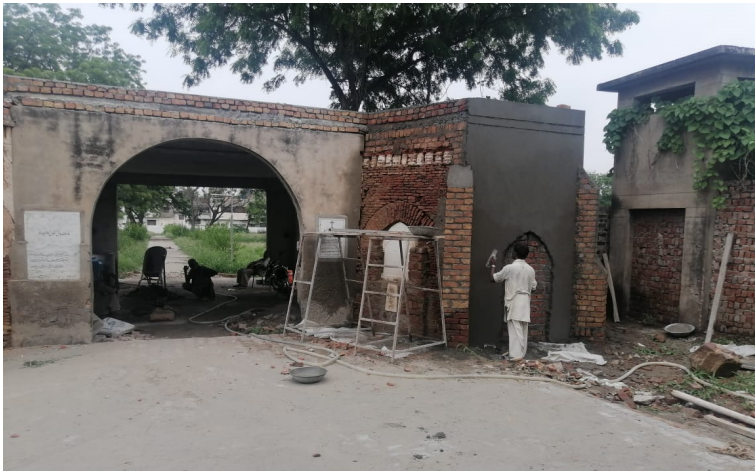
Dharampura (Mian Mir) Cemetery, Lahore, Pakistan.

To continue the momentum in this area, the Executive Committee reviewed its monumental inscriptions (MI) work and created a new post of Cemetery Records Officer to coordinate the process of adding further information to the online burials database. While the Coronavirus pandemic has limited progress in recent months, scoping work has been undertaken in association with FIBIS (Families in British India Society) to identify priority target locations, so that - when this is possible - in-country photography can be commissioned to add further information to the databases of both BACSA and FIBIS. Work in the meantime will focus on the various records held at the British Library and online source material. Details of how members can help will be published in the Autumn 2021 mailing .