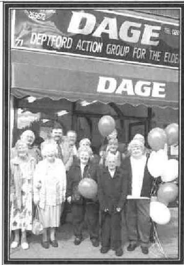
1 st anniversary of DAGE's premises' opening in May 2001 in Deptford High Street