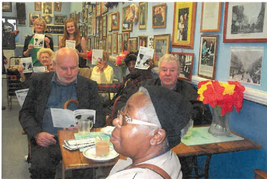
DAGE pensioners and volunteers at DAGE's centre for Age UK Lewisham, Healthwatch Lewisham and Independent Age