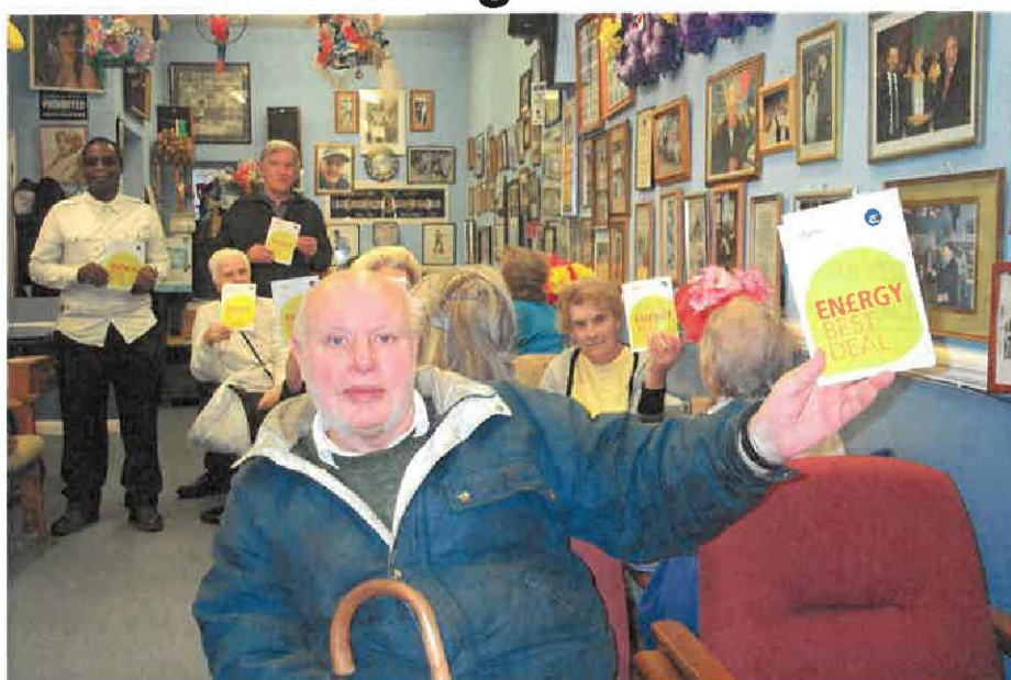
Above: Lewisham Citizens Advice's Energy Best Deal presentation Below: London Fire Brigade's safety advice and leaflet drop