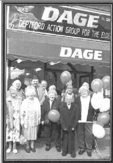
1 st anniversary of DAGE's premises' opening in May 2001 in Deptford High Street