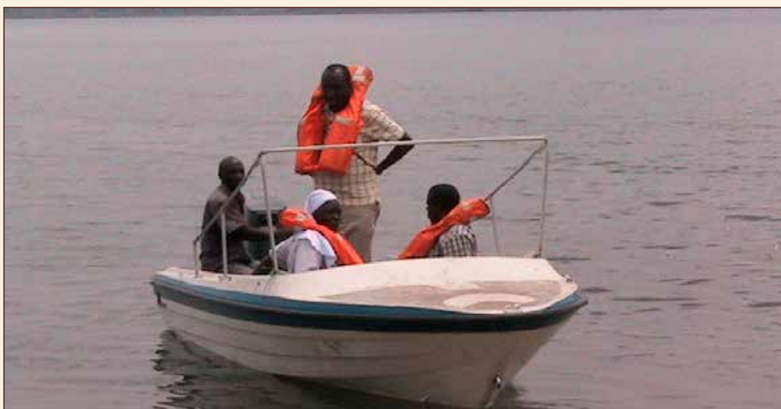
Pastoral outreach in Kigoma Diocese, Tanzania