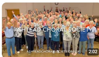
Ashtead Choral Society: 75 years and going stronger!