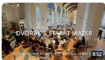
Choral highlights of Stabat Mater - Ashtead Choral Society, May 2025

Marketing – We more than doubled our investment in promotion which focussed on growing singer and audience numbers. This was mostly used for social-media advertising and we benefited from the skills of some of our members in developing promotional content and videos. Overall, our promotional efforts appear to have attracted more singers as described above, but less so concert ticket sales which rely heavily on members promoting concerts. This season provided useful experience allowing us to focus promotional efforts for future seasons.