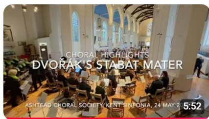
Choral highlights of Stabat Mater - Ashtead Choral Society, May 2025 375 views • 2 months ago

Marketing – We more than doubled our investment in promotion which focussed on growing singer and audience numbers. This was mostly used for social-media advertising and we benefited from the skills of some of our members in developing promotional content and videos. Overall, our promotional efforts appear to have attracted more singers as described above, but less so concert ticket sales which rely heavily on members promoting concerts. This season provided useful experience allowing us to focus promotional efforts for future seasons.