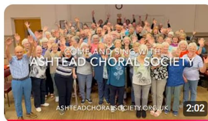
Ashtead Choral Society: 75 years and going stronger! 148 views • 2 months ago

Technology – During the year we purchased and configured the Making Music digital administration platform. This will allow us to operate a secure database for trustees to manage the society and will provide a dedicated members’ area on our website. We plan to launch this in the 2025/6 season.