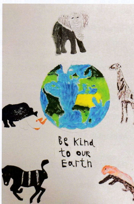
A collage of drawings by members of Active Citizens