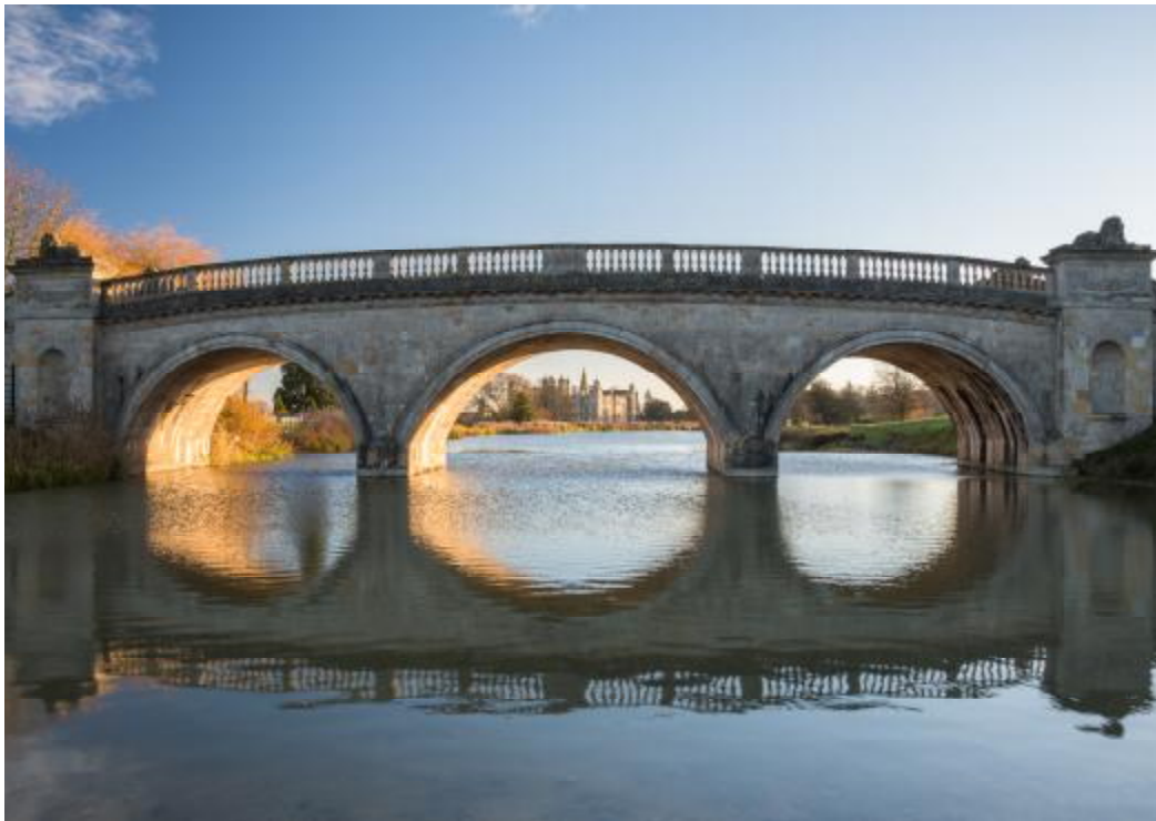
The Lion Bridge was designed and built by Brown in 1755 Lion Bridge was designed and built between 1773-77 to provide a focal point and to accentuate the idea of the lake being a sinuous river rather than a spring fed lake.

Brown's vision assumed that the landscape was to be enjoyed in motion, on foot or from the window of a carriage – he gave the visitor tantalising views and vistas of the House that were carefully considered and he achieved this through clever naturalistic planting. He also utilised the siting of the House, at the bottom of a natural amphitheatre, to great effect and all the views around the Park lead down to the House.