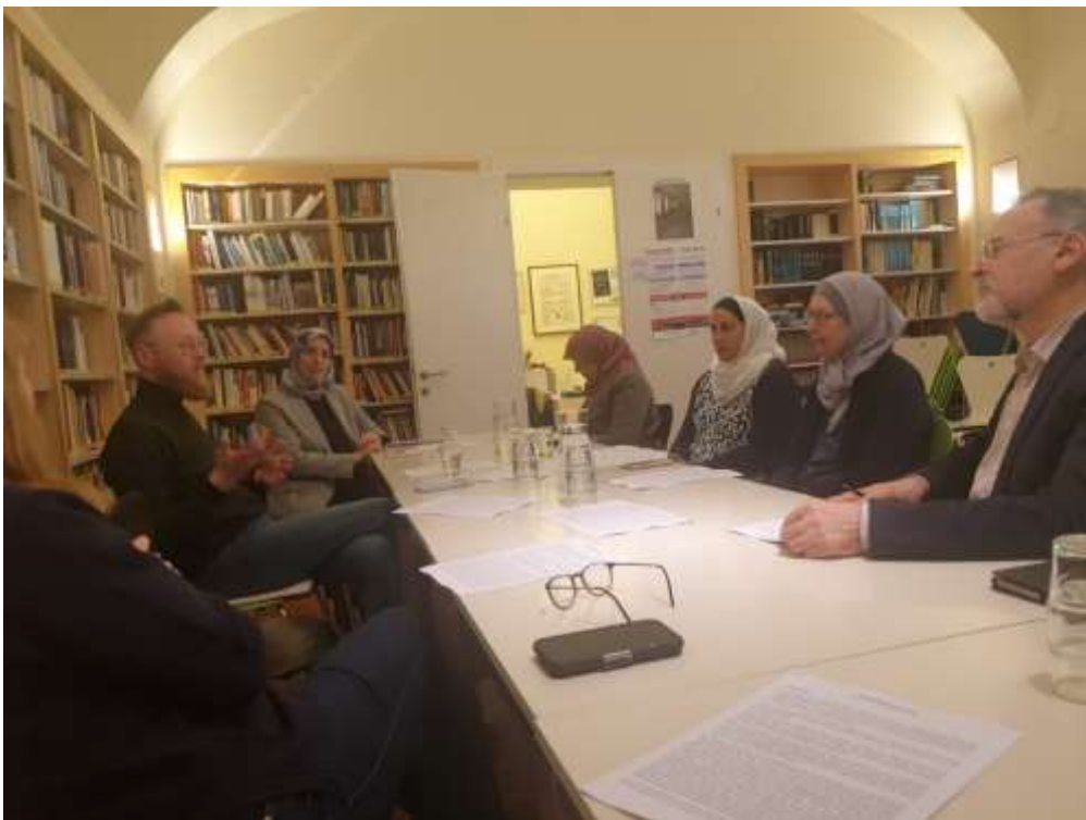
In Vienna, Jüdische Liberale Gemeinde Wien - Or Chadasch 's interfaith coalition is making strides