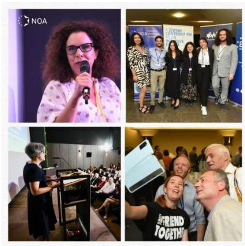
NOA (Networks Overcoming Antisemitism) European Conference in Brussels

The EUPJ Foundation is partnered with four other founding organisations, including the World Jewish Congress (WJC), the European Association for the Preservation and Promotion of Jewish Culture and Heritage (AEPJ), B'nai B'rith Europe, and the European Union of Jewish Students (EUJS). It is coordinated by CEJI – A Jewish Contribution to an Inclusive Europe.