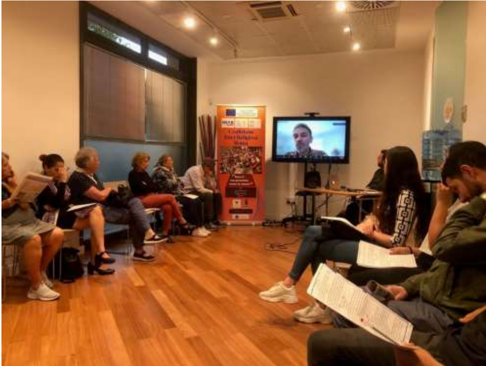
Comunità Ebraica Beth Hillel Roma just hosted another successful scriptures discussion, with more than 40 participants representing Judaism, Islam and Christianity. This edition's theme was Praise. Well done!