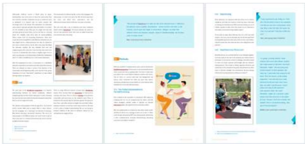
Neighbours Education Manual