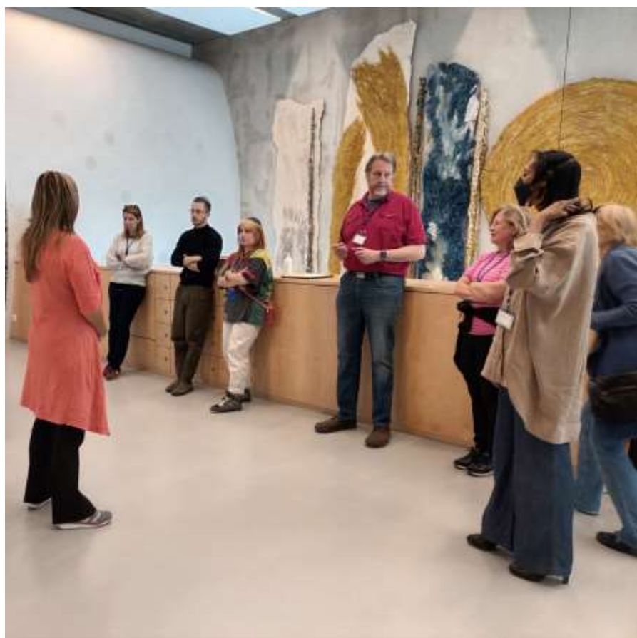
Training in LJG Amsterdam