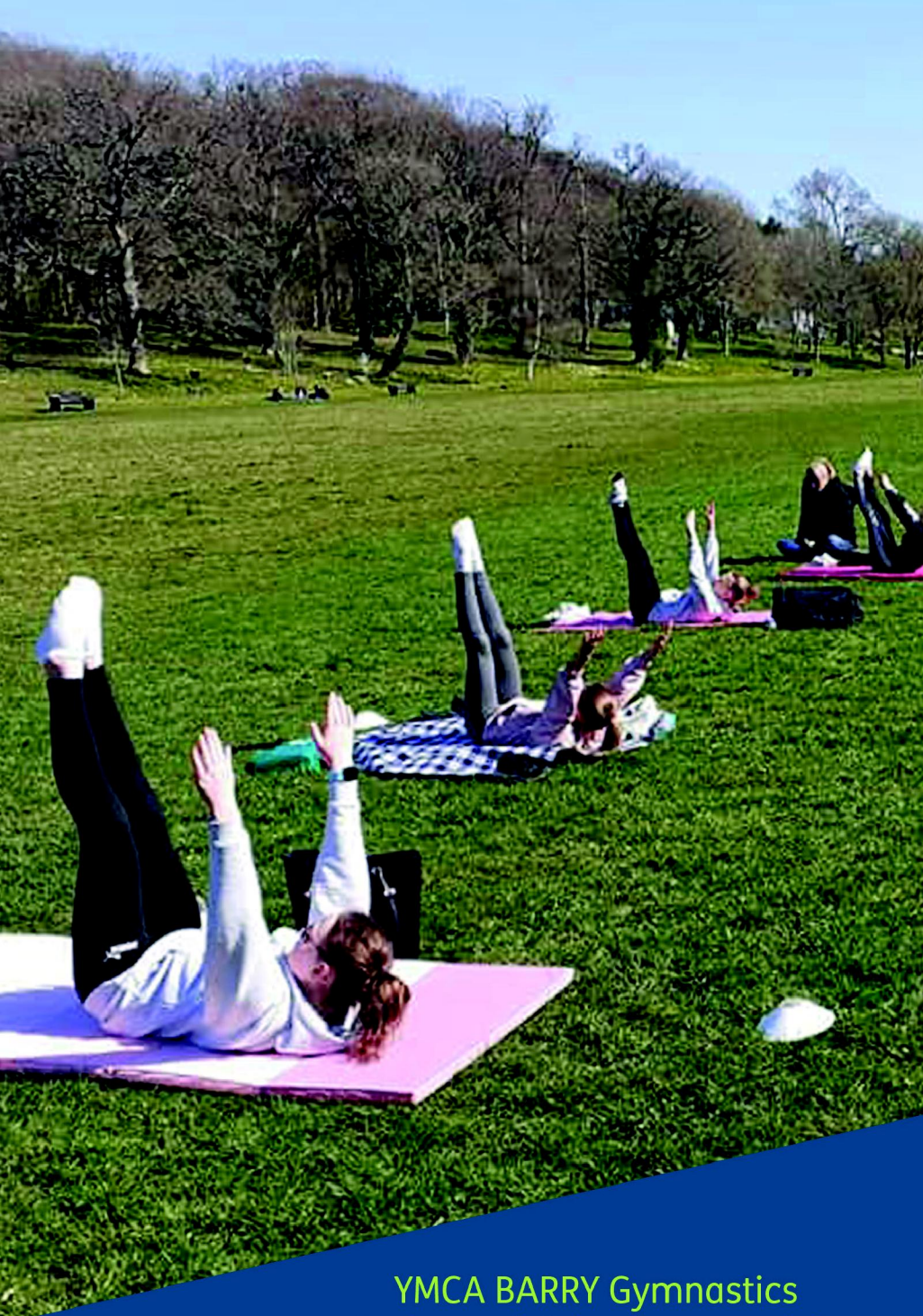
YMCA BARRY Gymnastics in the park & back at our club