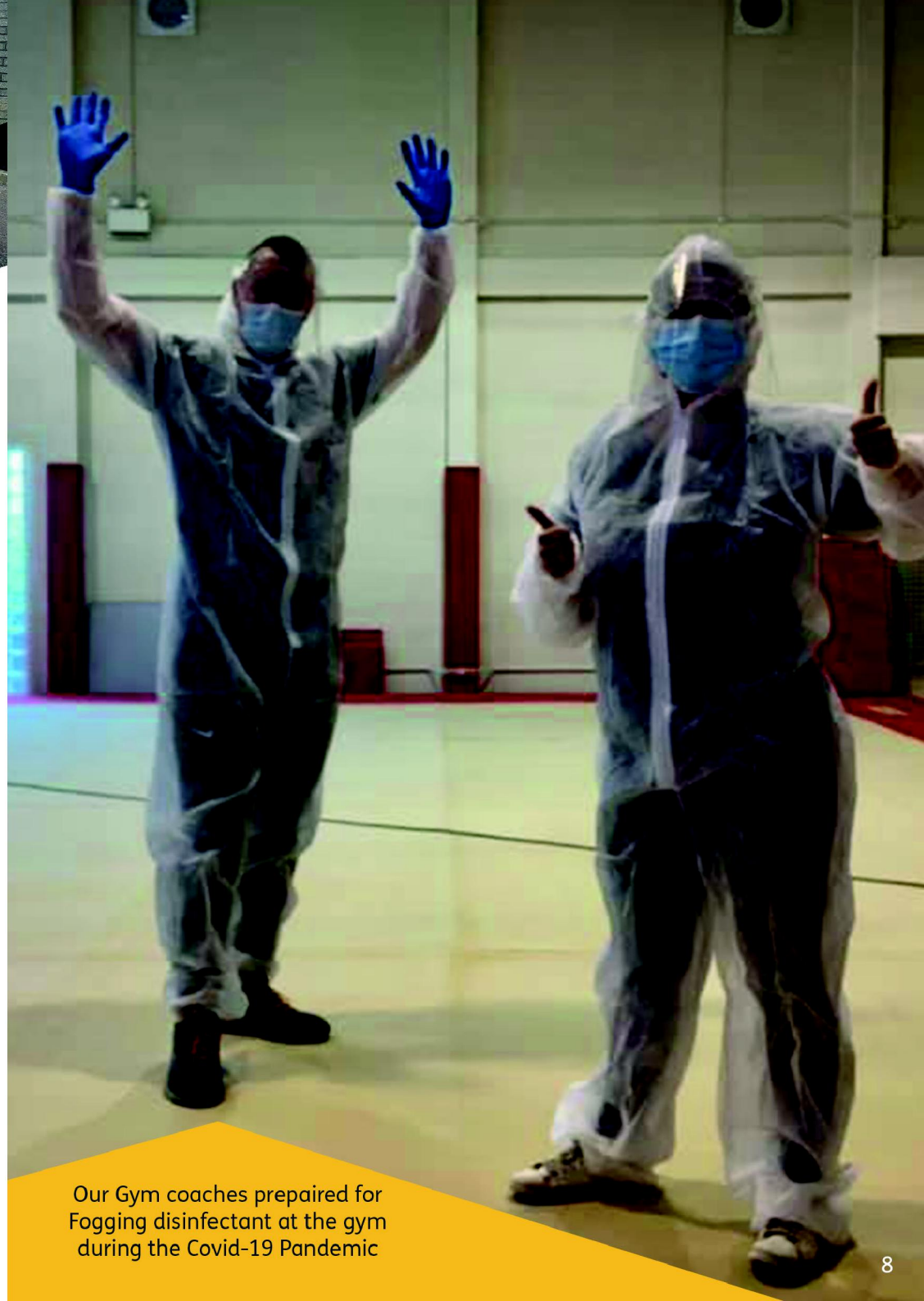
Our Gym coaches prepared for Fogging disinfectant at the gym during the Covid-19 Pandemic

In addition, to reduce the risk of contamination, the competitive gymnasts were all given a drawer each to store their equipment so it was not being taken between the club and homes daily. The outside of the building was also altered with queuing systems and social distancing markers to help parents during drop off and pick up time. Finally, due to a last minute clarification regarding sport returning, the gymnasium was split into three separate rooms by installing temporary polythene walls in order to stop the air moving around the gymnasium and to different groups of gymnasts. The club also received funding to have the entire gymnasium painted which was a lovely addition to the reopening preparation, as well as a new sound system and a disinfectant fogging machine to help fight the risk of Covid-19 spreading. The coaching staff all completed additional training which included Covid-19 Welsh Sport Association Training, COSHH Training as well as training within the centre to ensure everyone felt safe and confident with the new procedures.