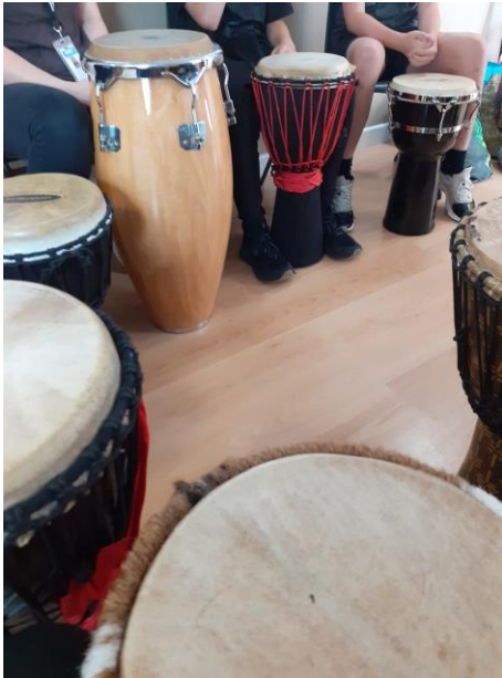
Summer music workshops