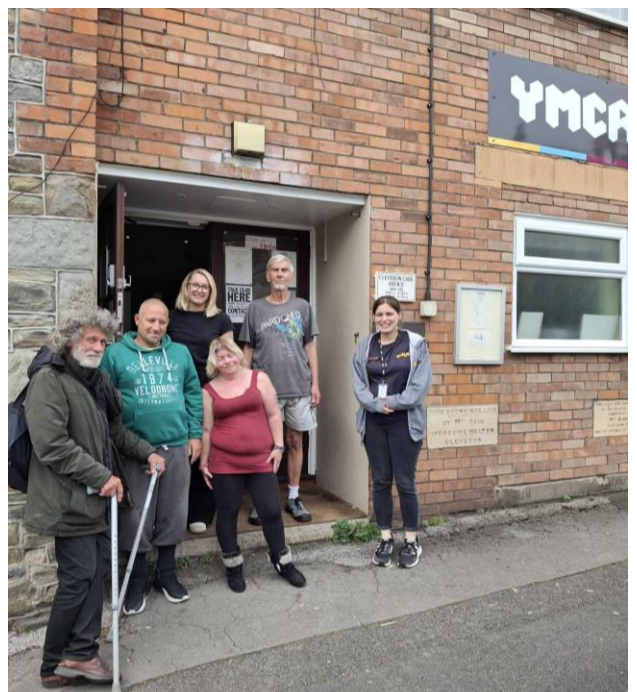
Volunteers, staff and members of the local community.