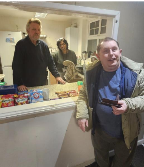
Propping up the Tuck Shop at Y Wednesday.