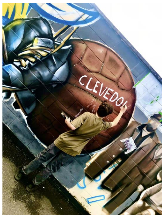
Mural at Clevedon Town FC

If you would like more information about the numbers of Young People who attend our After School Café or one-to-one mentoring then please get in touch with the office on YMCAadmin@clevedon.ymca.org.uk