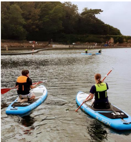
Session at Marine Lake Aug 2023

We had a music focus during the holidays. A youth band came to the YMCA to practice and we then took them to Portishead Youth Centre recording studio to record their music. We also worked with West of England Music and Arts who delivered percussion workshops where young had lots of different percussive instruments to try out from around the world.