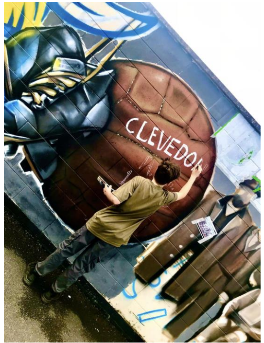
Mural at Clevedon Town FC

If you would like more information about the numbers of Young People who attend our After School Café or one-to-one mentoring then please get in touch with the office on YMCAadmin@clevedon.ymca.org.uk