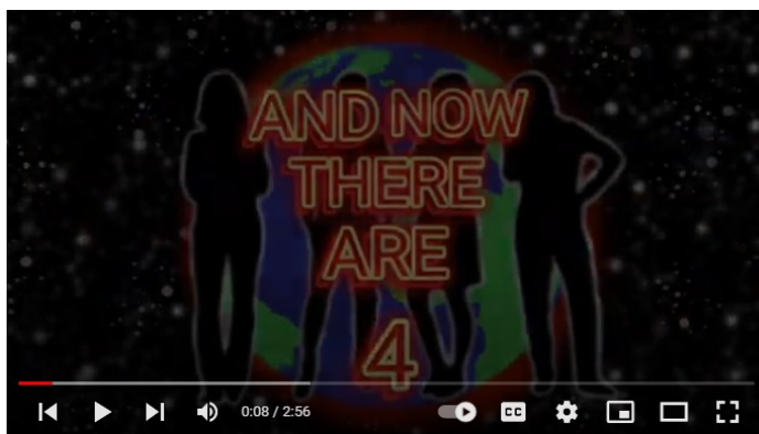
And now there are 4 - Runner Up of Film of the Month October/November 2022

All year we have run the disability sports sessions on a Thursday morning and arts and crafts on a Thursday afternoon. Since May 2022 we have run a lunch club. The lunch club is not a segregated activity and we have been pleased that members of the local community stop for a meal. We are a mixed bunch and it is great that everyone can sit down, chat and 'break bread' together whatever our differences. Without the volunteers who stepped forward to help with lunch and the arts and crafts it is hard to see how we would manage to run these activities. So, many thanks to everyone.