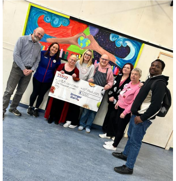
Staff, volunteers and service users at Clevedon YMCA.