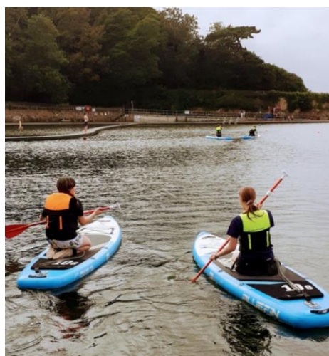
Session at Marine Lake Aug 2023

Trips that we have run in 2023-2024 included Clip n Climb, a guided bike ride with Strawberry Line Bike Hire, a virtual reality gaming experience in Portishead, a trip to Cardiff International Pool and paddle boarding sessions with SUPway Hire on Marine Lake. One young person said of the paddle boarding, 'It was absolutely amazing, I'd do it again'. It was a new experience for almost all of the young people who took part. We were particularly thankful to Shore Good Paddle Boarding for funding the paddle boarding sessions and to Strawberry Line Bike Hire for including us in their funded sessions.