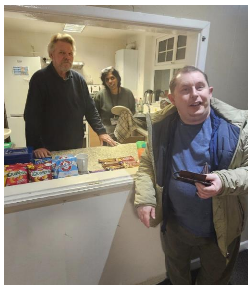
Propping up the Tuck Shop at Y Wednesday.