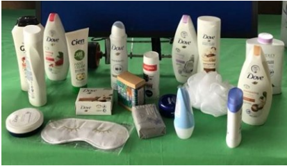
Gifts for victims of GBV