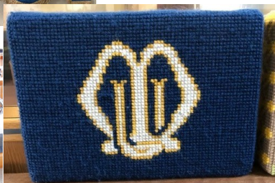
Lambeth Conference Visitors & our Links & Communication Lead