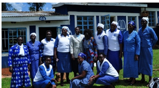
Kapsabet trip in Kenya, three MU members came on the Coventry Cathedral Diocesan Trip

The purpose of the trip with 'Transformation Now!' in mind, was to build stronger relationships between Mothers' Union members in both dioceses. It was also to learn and understand more about the lives of Mothers' Union members, family and community life in Kapsabet and share this learning with Mothers' Union members and others in Coventry Diocese. It was also to encourage Mothers' Union members in Kapsabet to learn about our styles of worship, outreach initiatives and to encourage meaningful friendships to develop – all underpinned by prayer.