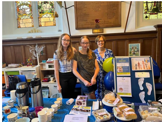
Cake sale in Walton on the Hill