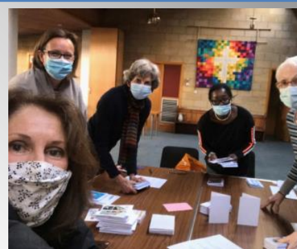
Writing Christmas cards for those using the foodbank

Engaging with families locally: Branch members continue to engage with local families leading and participating in a range of spiritual, social and practical activities along with their church communities. This includes: