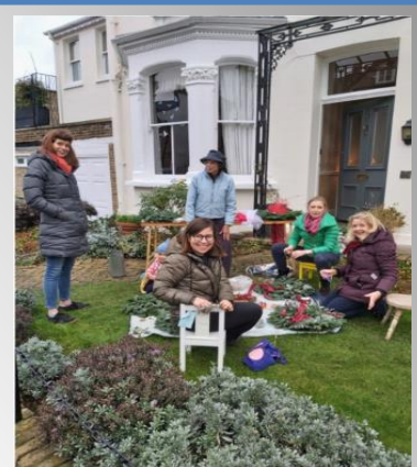
Making Christmas Wreaths – socially distanced Fundraising for MU Christ Church, Gipsy Hill

Supporting the vulnerable: The MU members have continued to support those suffering from or caring for people with poor health in the community which has been particularly difficult due to the restrictions to those in hospital. Sadly, the successful project known as Tea @ 3 at the Evelina Children's Hospital (based at St Thomas' Hospital) had to be put on hold as a result of the pandemic. Nevertheless, knitted items have been delivered to the hospital. In addition, many knitted baby items were delivered to: