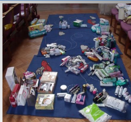
St. Mildred, Addiscombe delivered about 500 items of toiletries, baby items, children's books, toys and games to the local women's refuge & the Lily Trust