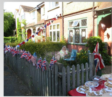
VE Day Garden celebration: Donations were given for the food which raised £48.70 for NHS Charities.

As Christmas arrived with restrictions continuing members thought creatively around how they could support each other including: