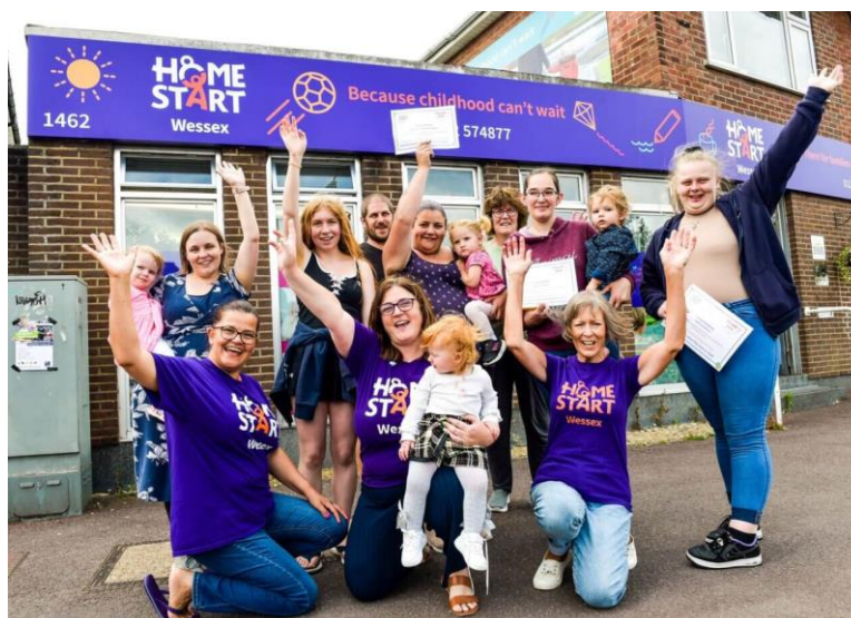
Figure 1 Home-Start Wessex

Talbot Village Trust's donation of £7,075 is helping to make the 'Kinson Haven Family Group' a reality - providing a vital support network for parents and young children in the Kinson area.