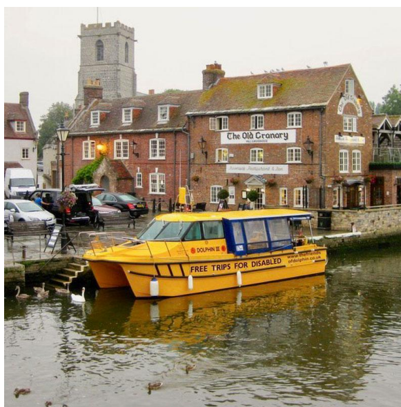
Figure 2 Friends of Dolphin

With the support of a £5,000 donation from Talbot Village Trust, The Friends of Dolphin can move forward with plans to replace their accessible boat, ensuring that inclusive harbour trips continue for years to come.